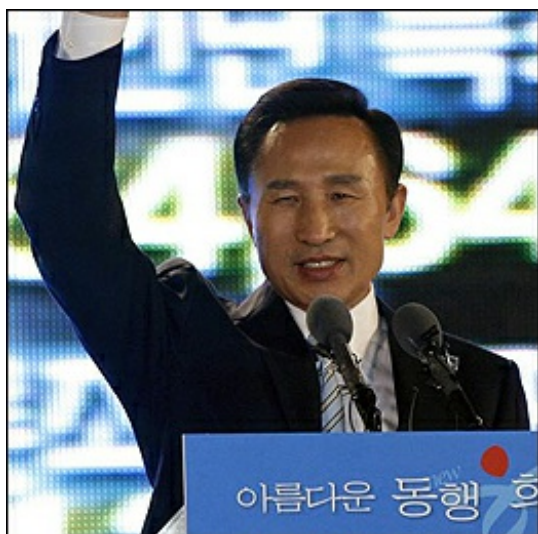
South Korean President Lee Myung-bak

Although Lee Myung-bak, South Korea's new president, asserts continuity with previous policies, he's also quick to point out his pragmatic approach toward North Korea. His foreign policy, dubbed the "MB Doctrine," focuses on a for-profit version of engagement that promises bold economic support to help increase North Korea's per-capita income to $3,000 within ten years if it abandons its nuclear weapons program. Tapping into frustrations expressed by many South Koreans at what appears to be stalled progress in North Korea's opening, Lee has pledged to "move away from the unilateral policy of appeasement that has been implemented without principle and embrace a strategy of reciprocity as a means to induce North Korea's genuine opening."