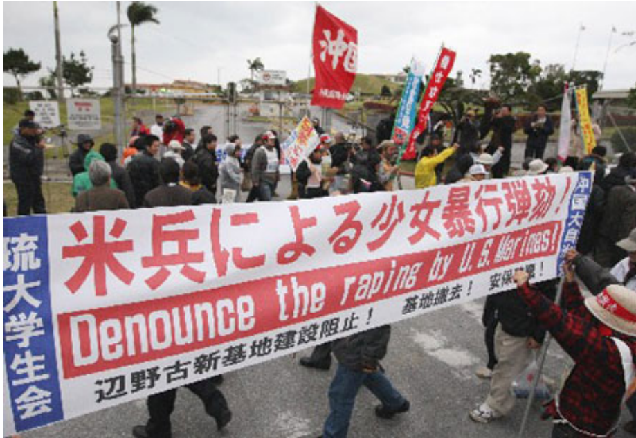
Okinawan protest at Marine Headquarters in Kita Nakagusuku village following news of the rape

Once an incident "blows over", as this latest one now has, the pundits and diplomats go back to their boiler-plate pronouncements about the "long-standing and strong alliance" (Rice in Tokyo), about how Japan is an advanced democracy (although it has been ruled by the same political party since 1949 except for a few years after the collapse of the Soviet Union), and about how indispensable America's empire of over 800 military bases in other people's countries is to the maintenance of peace and security.