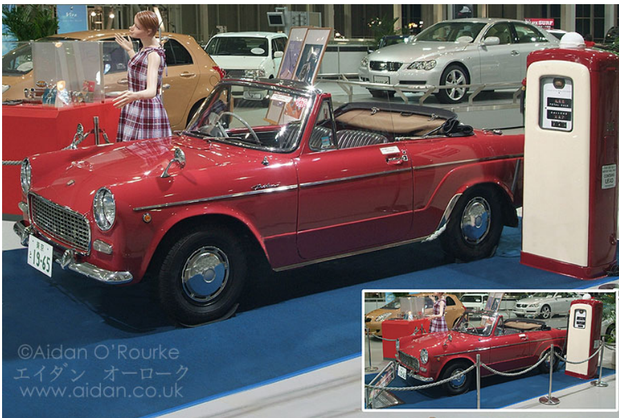
1960s Toyota Publica

Japan and Korea do not any longer combine “low incomes and low wages with significant innovative potential” – the third of the “distinct” challenges that China and India are said to pose. But that was arguably the case fifty years ago when Japan had a per-capita GNP that is smaller than China’s today at a time when the likes of Sony were seizing on the commercial potential for the transistor. One can accept that “China and India are associated with very different forms of regional integration” – the fourth so-called “distinct challenge.” But the picture the authors present of China’s integration – “the processing of imported raw materials and intermediates” -- has long also characterized Japan’s and Korea’s economic ties with the rest of the region.