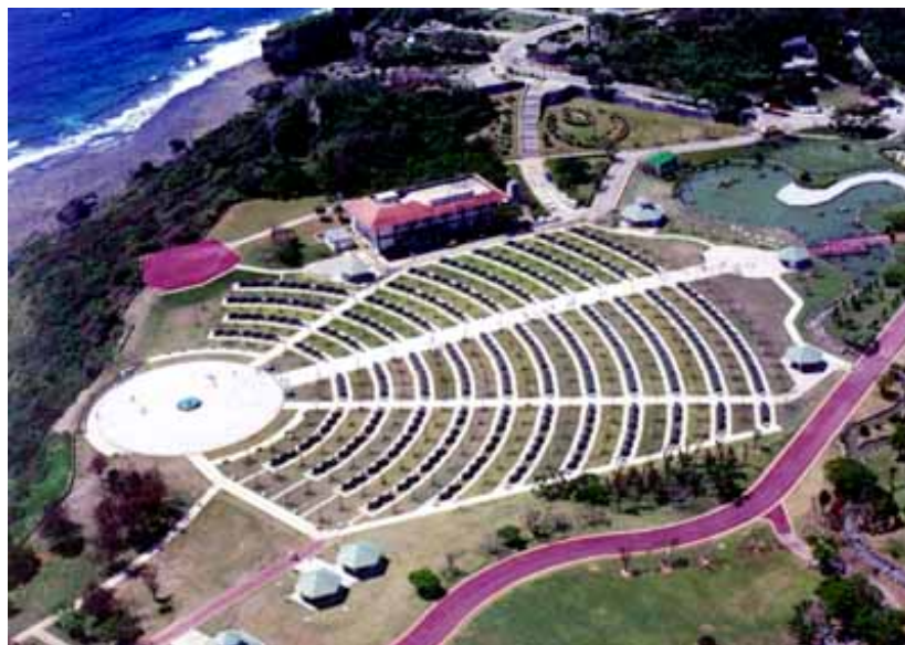
Cornerstone of Peace Memorial to Battle of Okinawa

Published in 1996, the program guide for the Okinawa Prefectural Peace Memorial Museum explains, "These deaths must be viewed in the context of years of militaristic education which exhorted people to serve the nation by 'dying for the for the emperor' ( Tenno no tame ni shinu ). [4] Okinawans cite the role of emperor-centered indoctrination of unquestioning self-sacrifice not only in compulsory group suicides, but also in many other deaths among the more than 120,000 local residents who lost their lives in the only Japanese prefecture subjected to ground fighting. [5] They also point to recently released documents showing that the Battle of Okinawa could have been avoided if the Showa emperor had not decided in early 1945 to prolong the war, rejecting the advice of former Prime Minister Konoe Fumimaro to end it immediately. [6]