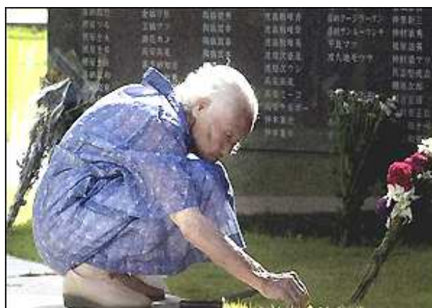
Paying respects at Okinawa Memorial

These are some of the reasons why criticism of and opposition to Japan's imperial institution, expressed in print and public discourse, is far more conspicuous and vigorous in Okinawa than in other Japanese prefectures. Such opinion was less in evidence during the first two postwar decades when limited information was available about the Showa emperor's role in decisions affecting Okinawa during and shortly after the war, and while Okinawa was still under direct U.S. military rule. It gained considerable momentum, however, with the approach of Okinawa's 1972 reversion to Japanese administration. Local educators were concerned because Japan's public school curriculum, overseen by the Education Ministry, presents distorted accounts of Japan's military aggression in Asia and downplays the Showa emperor's wartime role. Released for publication in the years since reversion, documents specifically describing both his wartime and early postwar role in decisions profoundly affecting Okinawa sparked outrage there that has fueled continuing criticism.