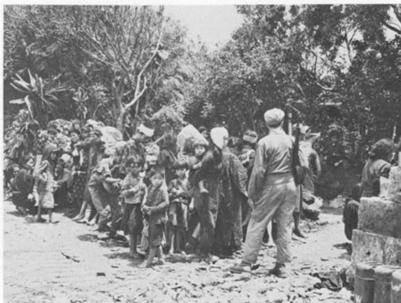
FIGURE 81.—Civilians of Okinawa, casualties from the battle areas, await their turns at the military government medical aid station, Gushikhan, Okinawa, June 1945.

The enormous sacrifices on both sides in this battle, including an approximate total of 200,000 dead[35], seem particularly outrageous to Okinawans because the Japanese military had decided six months earlier to abandon the prefecture as a "throw-away stone" ( sute-ishi ), a piece which is sacrificed, like a pawn, in the game of go. Okinawan civilians, including schoolchildren, were mobilized for a protracted war of attrition that Japan's military leaders hoped would inflict high American casualties, slowing the Allied advance, and buy time to prepare for an anticipated invasion of the mainland. They also hoped that high American casualties would lead the U.S. to accept surrender terms more favorable to Japan rather than risk an invasion of the Japanese main islands.