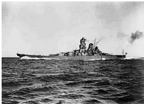
Battleship Yamato running trials

The result: six of the ten warships that made up the fleet were sunk, including the flagship Yamato, with 3,700 men lost.