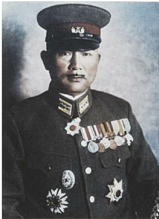
Gen. Kuribayashi Tadamichi, Commander of Japanese forces, Iwo Jima. Photo touched up to show him as a full general, the rank to which he was promoted following the gyokusai . When he died, he was a lieutenant general. For a related article about him, click here .

As a matter of fact, more than a year before the U.S. decided to send its soldiers into Iwo Jima, that is, in February 1944, Prime Minister Tojo Hideki, in his "emergency declaration," had made the sweeping call: ichioku gyokusai , "100 million gyokusai ." It was a demand that the entire Japanese population be prepared to die. Japan's mainland population at the time was 70 million, so he was also ordering Taiwanese and Koreans to meet the same fate.