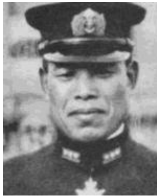
Vice Adm. Ito Seiichi

The so-called kamikaze tactic [7] was put into practice during the Battle of Leyte Gulf (October 23-25, 1944).[8] Less than half a year later, when Vice Adm. Ito Seiichi showed reluctance to lead Japan's last sizable naval sortie, without air cover, to Okinawa on a similar suicidal mission, he was told, "You are requested to die gallantly in advance of the 100-million gyokusai ." [9]