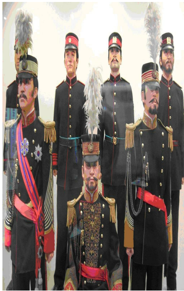
Lt. Gen. Yamashita Tomoyuki