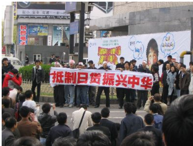
2005 Beijing demonstration calls for boycott of Japanese goods

There is no real public opinion in China. So-called 'public opinion' is all under state control, guidance and manipulation. If public opinion is not welcomed by the government, it will be immediately erased. If an opinion conforms to government views, then it will be encouraged. For instance, the government does not allow any street protest regardless of the reason, yet anti-Japanese protests alone were 'freely' conducted right in front of the military police.