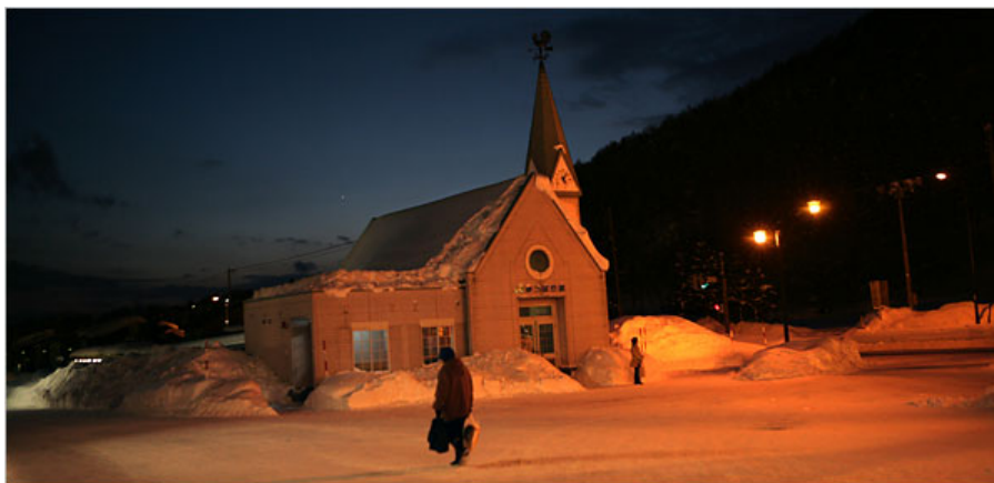
Cost cutting measures included closing the bathroom at the Yubari train station

Perhaps the best known example of a spiral of decline – but far from the only one – is Yubari, in Hokkaido, where the local government filed in 2006 for financial reconstruction, a form of municipal bankruptcy. Once a thriving coal-mining centre, the town had attempted to counter decline by spending on local tourist attractions, until it had a debt of ¥36 billion backed by annual municipal revenues of only ¥4.5 billion. The city is now cutting municipal staff by half, consolidating seven elementary schools and four high schools into two facilities, doubling fees for water and sewer services, and increasing resident taxes. These desperate measures have accelerated the outflow of people from what was already a declining population (Asahi Shimbun November 16, 2006).