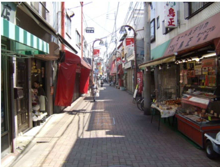
Shotengai, Arakawa, Tokyo

The first part summarizes the greatly changed conditions structuring the success and failure of Japanese cities, towns and villages that have emerged during the last decade. This is a combination of a shrinking and rapidly ageing population, and significant reductions in central government redistribution of taxes. Central government has long played a major role in municipal finance by redistributing funds from richer regions to poorer regions to ensure that all localities can provide a roughly comparable level of services. Significant reductions in such redistribution means that localities will have to rely on their own resources to a much greater degree, and growing disparities between places can be expected. This will greatly amplify the difficulties created by existing disparities of population decline and ageing. Some places are much better positioned to face the increasing challenges of this new context than others, and the current tendency towards spirals of decline in less favorable places is likely to strengthen.