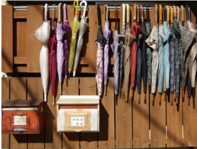
Sanya Homeless Hostel, Tokyo

This analysis assumes first that local governments have meaningful policy options, and second that there are significant numbers of people who have choices about where they will live, independent of the location of jobs. With regard to the first assumption, it is clear that Japanese local governments face huge challenges of population shrinking and aging, economic stagnation, and extremely difficult financial circumstances. Also, most policy levers, legal powers and financial resources have long been located in central government ministries, leaving little scope for local innovation or bottom-up entrepreneurialism, so local policy-making became increasingly oriented toward attracting central government resources, whether or not the projects or policies thus supported were actually beneficial. The situation certainly appears bleak.