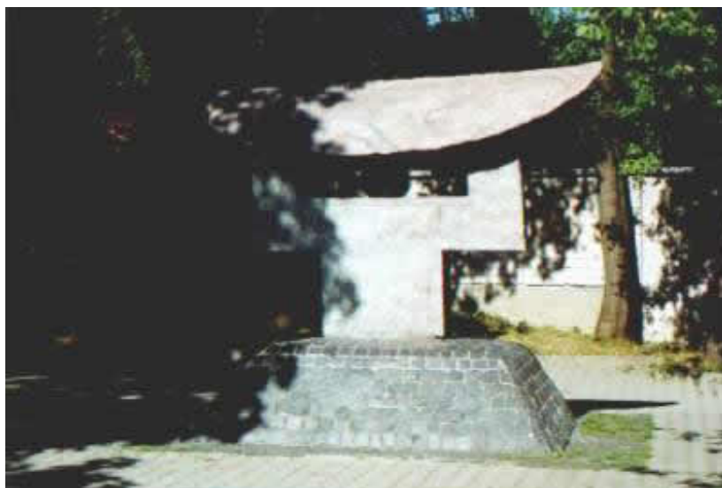
Sugihara Memorial in Vilnius, Lithuania

The main event, which the entire life story of Sugihara is assembled to highlight, is his act of issuing the life-saving transit visas to the Jewish refugees. Indeed, there are few other critical events in the story. As articulated in the previous section, his role in securing the purchase of the Manchurian railroad is described in some detail; likewise, the story touches on his various positions as diplomat, government official, and Russian specialist, at times even hinting that he worked as a spy. The narrative leaves no room for doubt, however, that the main event—the event for which Sugihara deserves to be recognized as a great man, and for which he should be remembered—is his act in Lithuania of saving Jewish refugees.