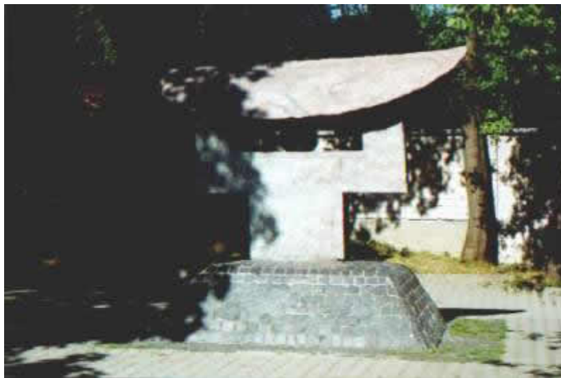
Sugihara Memorial in Vilnius, Lithuania

The main event, which the entire life story of Sugihara is assembled to highlight, is his act of issuing the life-saving transit visas to the Jewish refugees. Indeed, there are few other critical events in the story. As articulated in the previous section, his role in securing the purchase of the Manchurian railroad is described in some detail; likewise, the story touches on his various positions as diplomat, government official, and Russian specialist, at times even hinting that he worked as a spy. The narrative leaves no room for doubt, however, that the main event—the event for which Sugihara deserves to be recognized as a great man, and for which he should be remembered—is his act in Lithuania of saving Jewish refugees.