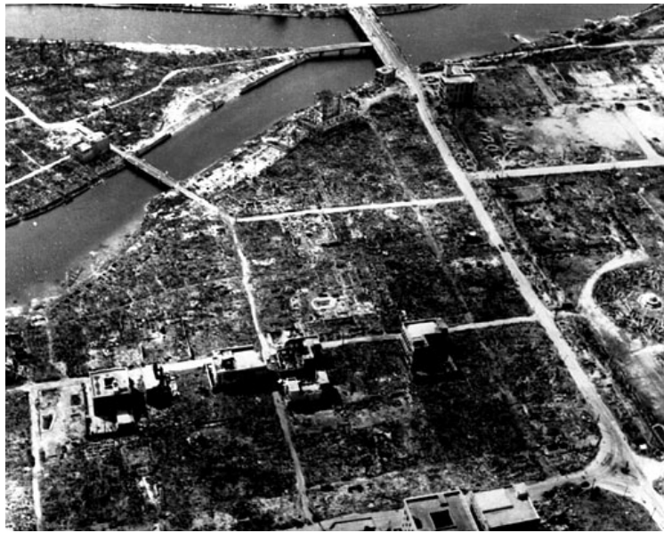
Aioi bridge after the atomic bomb.

I switched to Honkawa Primary School, and in summers we dove off Aioi Bridge. In the band of urchins, it was bad form not to dive headfirst. If you jumped feet first, they said, "He's no good." So even though it was crazy, we dove headfirst. Dive off the railing, and you glided along the bottom. Where there was a river of white bones. Even now if you dig there, you'll turn up a ton of bones. Those areas have never been swept, and even now there must be lots of bones buried in the sand.