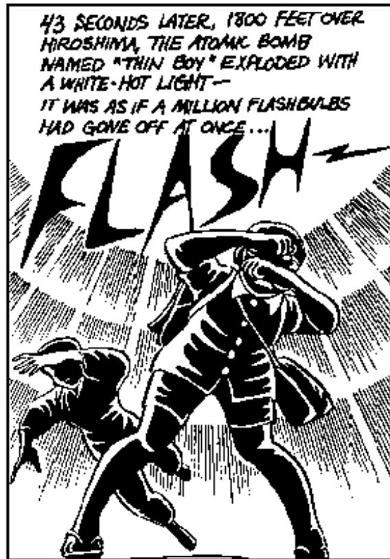
The atomic bomb explodes

My second oldest brother was then a third-grader. Back then, school evacuations began with third grade. I envied him, thinking that if you went to the countryside, you'd probably be able to eat your fill. But a letter came, and in it he moaned that he was getting thinner and thinner and please send soybeans. So I heard Dad say more than once, "I wonder if we should bring him back." It was just before the atomic bomb. Had Dad brought him back, they'd have died together in the atomic bombing. Even if you went to the countryside, you couldn't eat your fill: I realized that keenly.