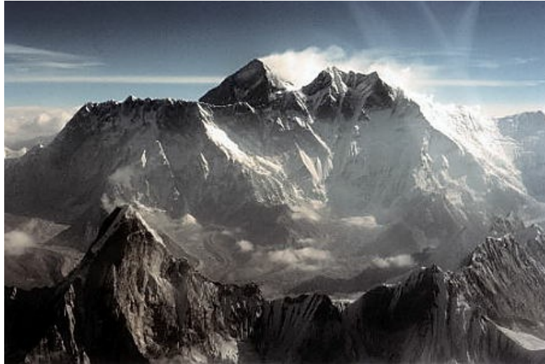
Aerial photograph of Mount Everest

Aerial photographs taken by The Asahi Shimbun aircraft Asuka, in cooperation with Nagoya University field researchers, show that glaciers there have become thinner while lakes that hold the water of melted glaciers have rapidly expanded in the 30 years since the last photos were taken by the university.