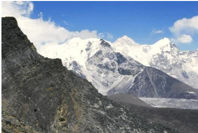
Island peak from Chhukhung Glacier