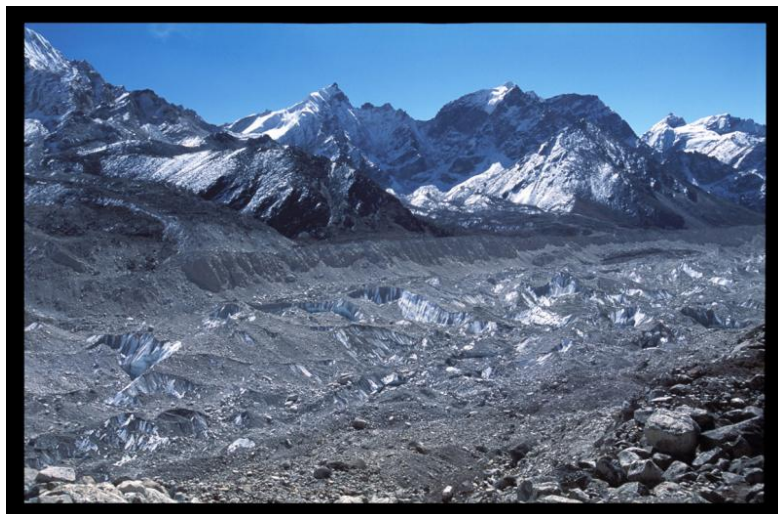
A 2001 photograph of the Khumbu Glacier from Kala Pattar, 5,400 meters

In one of the areas, the researchers found Khumbu Glacier, which is already known to have become thinner, meandering for about 17 kilometers with a width of about 500 m. As many parts of the glacier were covered with soil, it looked like a brown river.