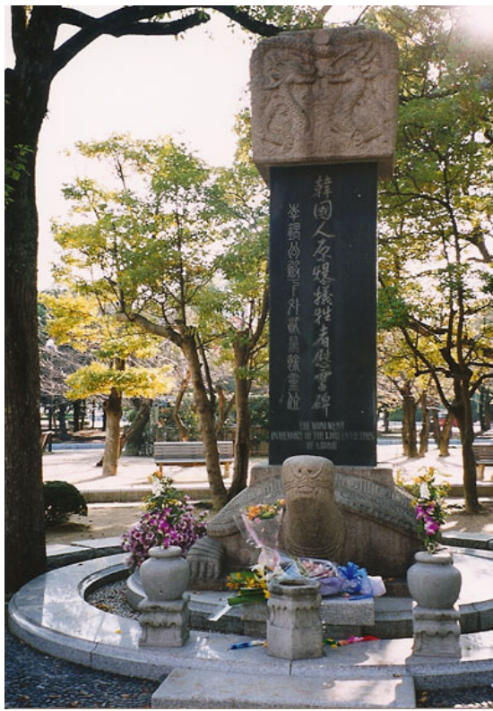
Memorial for the Korean victims of atomic bombing in Hiroshima