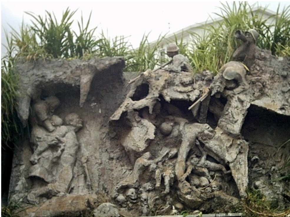
Okinawan sculptor Kinjo Minoru's relief depicting the horror of the Battle of Okinawa, during which many Okinawans were killed or forced to commit suicide after seeking refuge in the island's caves.