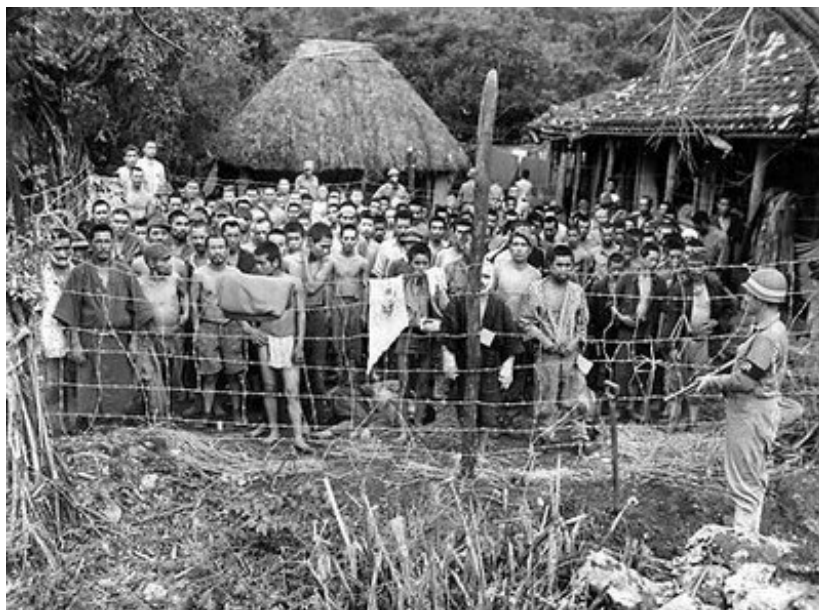
A Marine guards Japanese prisoners of war after the Battle of Okinawa. More than 148,000 civilians died in the campaign.

The extreme fear of "brute Americans and British" [cultivated by the Japanese military] was a factor that made people choose death. Japanese military experiences of slaughter of Chinese people on the continent since the "Manchurian Incident" was widely discussed; and about the fate of residents at large at the time when the war turned out to be a "losing battle", people despaired anticipating plunder, violence, slaughter by the American military. There were returned migrants who thought "the American military can no way be expected to kill residents", but returnees were regarded as suspected spies and hence were unable to speak positively. To make such a statement was to court denunciation as a spy and slaughtered.