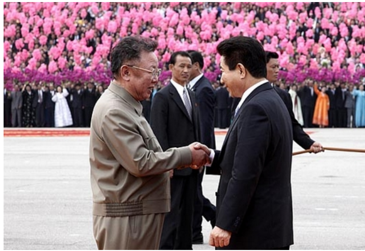
Kim Jong-il and Roh Moo-hyun (right)