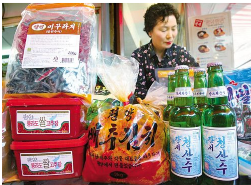
North Korean products

However, embracing the new market-influenced economic reality proved controversial and the initial efforts naive. Take for example the much-lauded so-called government measures of July 2002. Pyongyang, whose position vis-à-vis the West had considerably improved in 2000–2002, probably hoped these changes would prompt its neighbors (especially Japan and South Korea) to increase economic and financial aid, thereby helping increase consumer supply and reinvigorating production on a more realistic commodity exchange basis using the new flexible price and currency system.