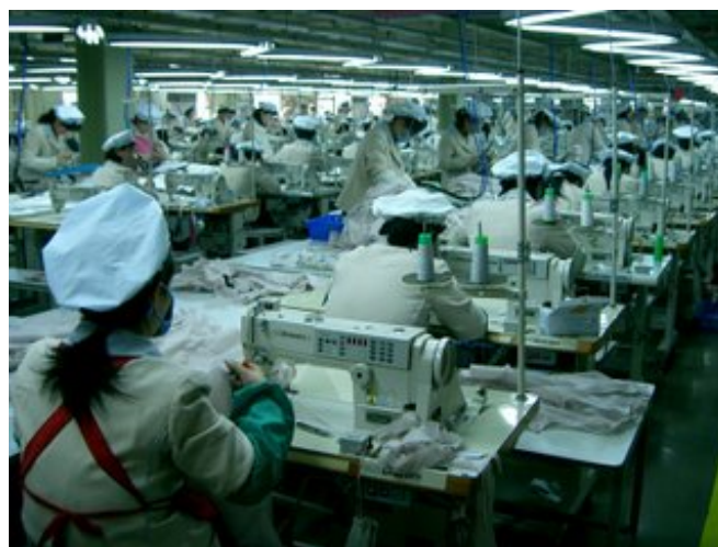
Workers in the Kaesong Economic Zone

However can the clock be turned back? The introduction of market principles into what was supposed to become the international market-oriented sector of the economy became one of the leadership's priorities. This process, which started in the mid-1990s, included attempts to create joint ventures and establish free economic zones as testing grounds for new policies. Most significant was the attempt to start the Rajin-Sonbong special economic zone in 1997 based on the "testament" of the late Kim Il-sung. Although many of these efforts were unsuccessful owing to North Korea's isolation, the closed character of its economy and the lack of trust in it, and the insufficient experience and poor decision-making capabilities of North Korean "business people," cooperation with South Korea turned out to be a major channel through which to introduce capitalist management. The Kaesong free economic zone, the Mt. Kumgang tourist project, and the upcoming Mt. Paektu tourist project are examples. Recent agreements between the prime ministers of North Korea and South Korea on developing Haeju, cargo traffic, communications in the Kaesong zone, and shipbuilding facilities in the DPRK with ROK assistance are encouraging as they broaden the scope of the South Korea-sponsored market sector in the DPRK's economy. (However, it remains to be seen whether the Lee Myung-bak administration presents new conditions for their implementation.)