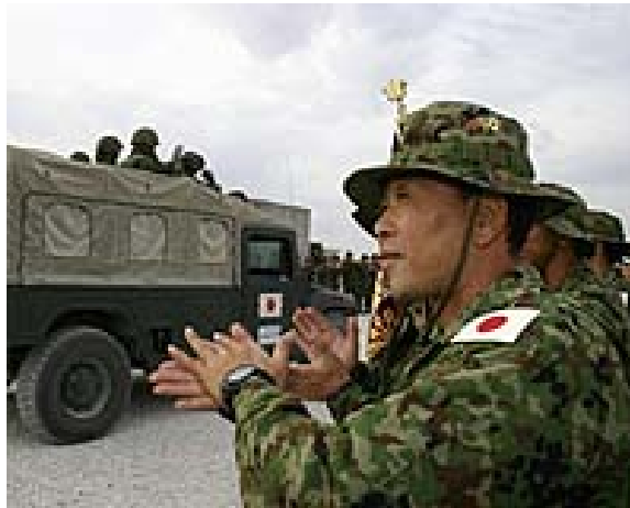
GSDF Troops in Iraq

On July 19, 2006, the final elements of the Ground Self-Defense Forces (GSDF) mission rolled across the border between Iraq and Kuwait. The 2 1/2 year mission in Samawa ended without the deaths of any GSDF member on Iraqi soil -- although it was indirectly related to the deaths of several Japanese civilians. As this watershed event was taking place, the future policies of the Japanese government remained shrouded in uncertainty. Was this the effective end of Japanese support to the post-Saddam Iraqi government? Or was it simply the beginning of a new phase?