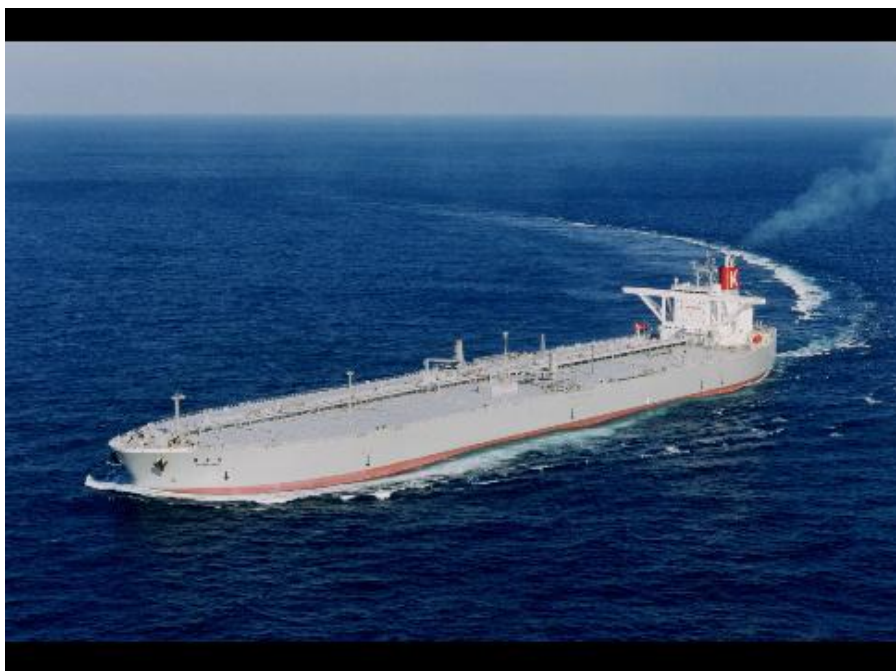
A Japanese oil tanker

Still, Japanese oil companies did get involved. In April 2005 the Japan Petroleum Exploration Company signed a technical assistance agreement with the Iraqi Oil Ministry. The Arabian Oil Company followed suit a couple of months later in June 2005. These moves were well-understood by all parties as being preliminary steps toward much deeper Japanese involvement in the Iraqi oil industry in the future.