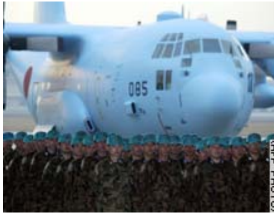
An ASDF C-130

What we can surmise from the sparse information that has appeared are the following facts: The mission, or at least preparations for it, seems to have begun in the fall of 2003 at about the same time as the GSDF deployment to Samawa. The main operations are conducted from Ali al-Salim Air Base in Kuwait, and involve about two hundred men and three C-130 transport planes. An additional ten ASDF officers serve at the U.S. Air Force Central Command, which is apparently in Qatar. It is not clear what the ASDF planes are actually transporting, but they have denied rumors that their cargoes include ammunition for U.S. forces.