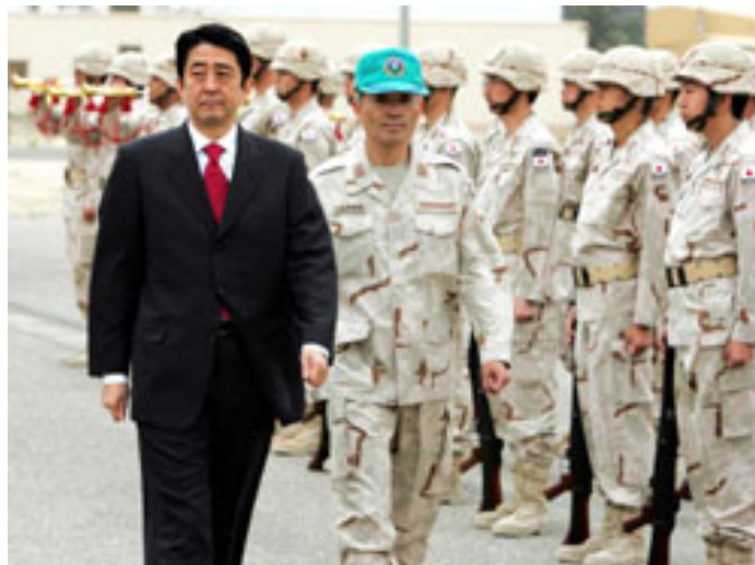
Former Prime Minister Abe Shinzo reviews ASDF troops in 2007

Significant Japanese newspaper reports on the ASDF mission did not begin appearing until April 2006 when the Asahi Shinbun ran a five-part series that had clearly gained official cooperation. A year later, then-Prime Minister Abe Shinzo allowed himself to be photographed inspecting the troops during his April-May 2007 tour of the Persian Gulf.