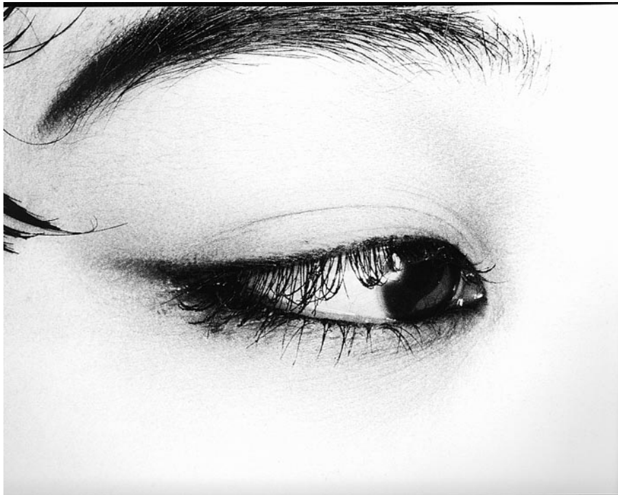
From the collection at the Barbican in London