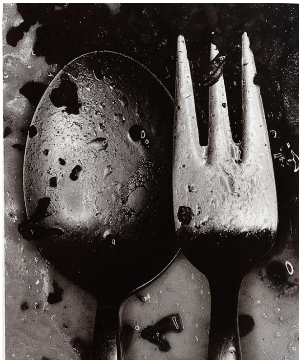
From the collection at the Barbican in London

Araki can sometimes be spotted at night, walking around Shinjuku and talking to well-wishers. Tokyo’s DNA is imprinted so deeply on his soul that he claims to be incapable of photographing anywhere else. He was born in the downtown shitamachi district in 1940 and his life mirrors its rise from the smoldering ashes of World War II. He calls the city his “womb” and his “mother” and he seems to both feed off and reflect its vast energy as he pounds the streets, a stubby, comical force of nature armed with an arsenal of cameras.