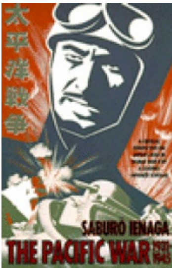
Ienaga Saburo's The Pacific War.

A study of the postwar politics of revelation of Japanese wartime medical experiments does not engage the issues of the causes of those initiatives and cannot predict the degree to which we might see questionable medical practices surfacing again in Japan's future. But by shifting the focus from the purported "culture" to the politics of Japanese "forgetfulness" after 1945, it does suggest that an important indicator of future developments may be found less in certain Japanese cultural practices (as is often stressed in the literature on Japanese bioethics),[73] than in the political lay of the land. The politics of exposure of wartime Japanese BW experimentation remains as vital as ever and continues to enrich Japanese public consciousness regarding this dark chapter of national history. Likewise, critical issues of bioethics (brain death, stem cell research, etc.) have become the focus of heated political debate.