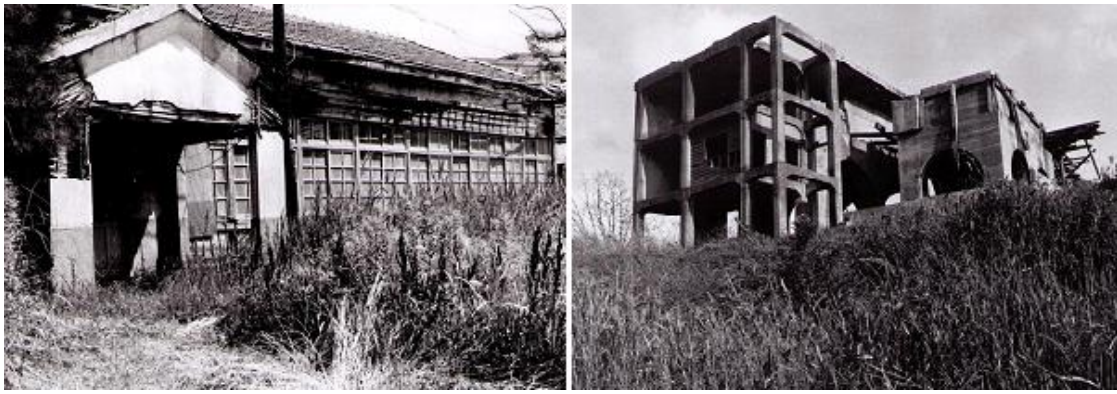
The abandoned Aso Yoshikuma work office (left) and ruined Yoshikuma mine buildings in the late 1970s.