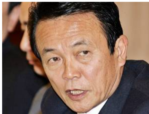
Aso Taro: Japan's future leader?

Japan the Tremendous , a bestseller written in a populist tone, highlights the peaceful nature of postwar Japan and calls the country a "fount of moral lessons" for Asia. Arc of Freedom and Prosperity: Japan's Expanding Diplomatic Horizons expatiates on Aso's tenure as foreign minister from October 2005 to August 2007.