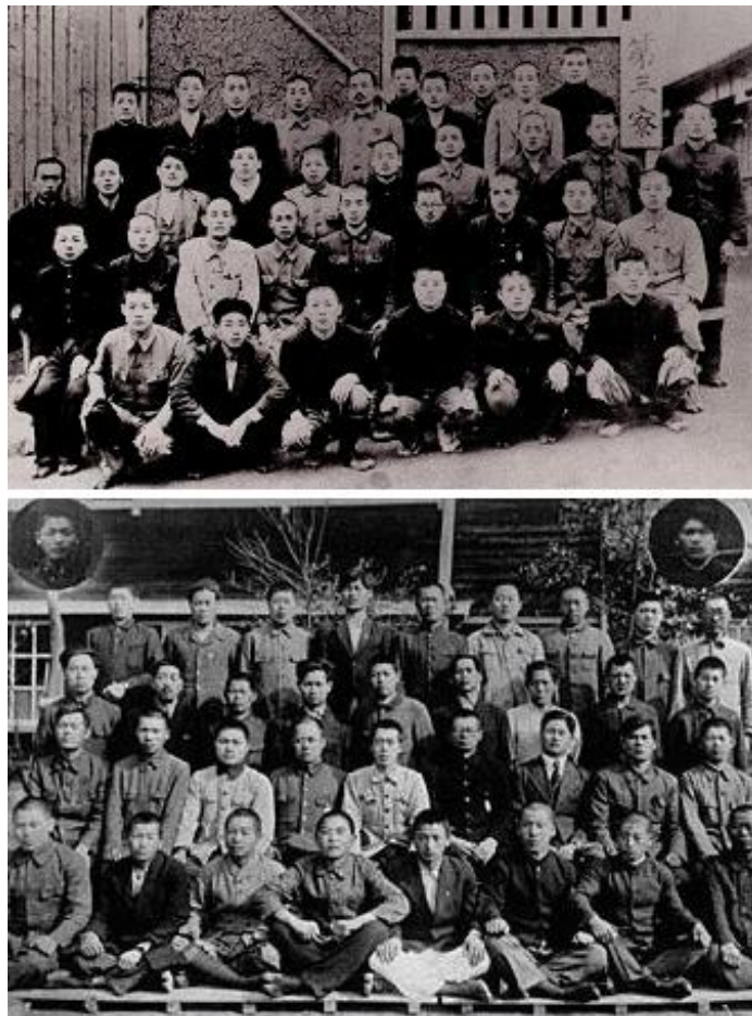
Young Korean labor conscripts at Aso Mining's Atago mine: workers assigned to the Jowa dormitory in 1942 (top) and the Yamato dormitory in 1943.

Aso Mining was employing 7,996 Korean conscripts as of January 1944, according to a wartime report by the Special Higher Police (Tokubetsu Koto Keisatsu), and 56 conscripts had recently died. Fukuoka-based historians estimate Aso used a total of 12,000 Koreans between 1939 and 1945. The wartime police report shows that 61.5 percent of Aso's Korean laborers resisted conscription by fleeing their work sites, the highest percentage of runaways in the region. While this figure indicates that security conditions were not prison-like, most Korean conscripts in Japan were never properly paid for their work.