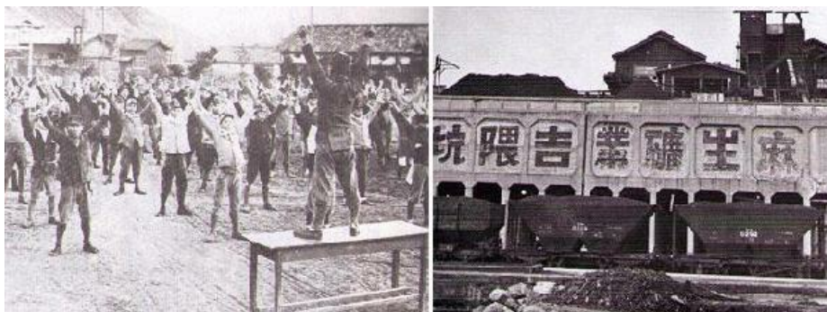
Left: Aso miners doing calisthenics during the war; right: ore cars at the Aso Yoshikuma mine.

“In response to the enemy’s materiel offensive, we will fight by means of increased coal production,” said Kishi Nobusuke, then Japan’s minister of commerce and industry. “All miners must come together in spirit and the patriotic mining industry must dash forward.”