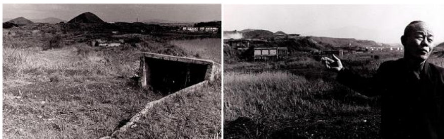
Aso Mining's former Akasaka mine in the late 1970s and a Korean forced to work there during World War II.

"The corporations' survey of remains has been insincere," the South Korean official said. "It is also strange that the family company of the foreign minister, who should be setting an example, has provided no information whatsoever." [2]