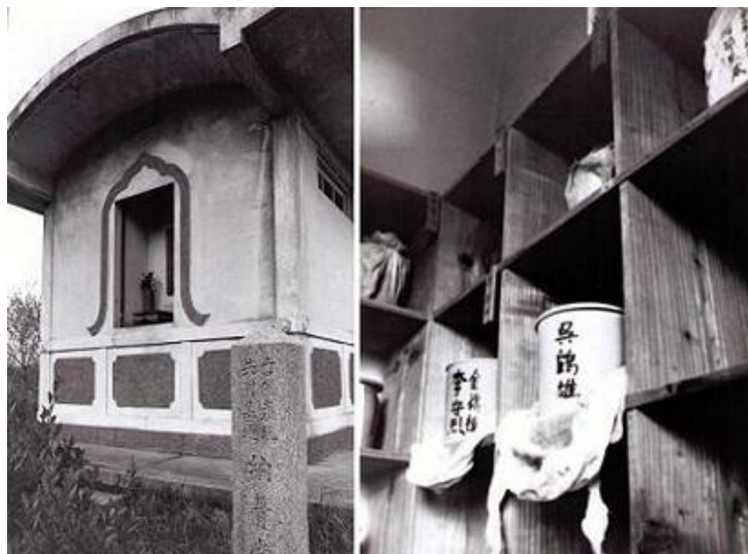
1975 images of the exterior and interior of the Aso Yoshikuma charnel house. Six containers of Korean ashes (right) disappeared the following year.

By 1976, however, all six sets of Korean remains had been removed from the charnel house shelves. Hayashi was shown a small hole beneath the shelves and told by the Buddhist priest in charge that the Korean remains had been deposited in an underground storage area. The unusual funerary practice was not further explained.