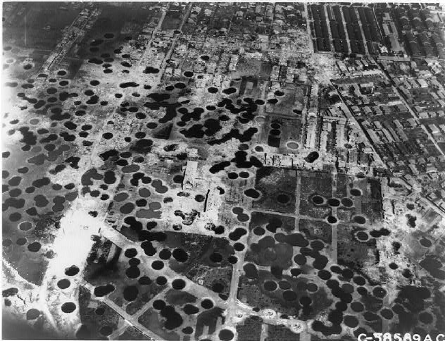
Osaka damage from bombing raids