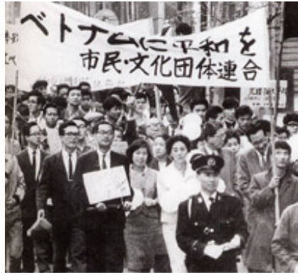
Beheiren Anti-Vietnam War demonstration of April 24, 1965 shows the formality of the Beheiren style in the glare of the hoped for international media

In particular, he promoted the idea that the Japanese people should avoid becoming "war perpetrators," by refusing to collaborate with the United States in bombing and killing Vietnamese. He pointed out that Japanese media had paid ample attention to the victimization of Japanese by firebombs and atomic bombs, but little to the role Japanese played as assailants during the Asia Pacific War and subsequent Asian wars. To grasp the possibility of Japanese becoming assailants in the Vietnam War, he stressed the necessity of clearly recognizing the historical fact that the Japanese people had been both victims and assailants in the Asia-Pacific War. It was a powerful appeal at a time when not only the general population but also many intellectuals were preoccupied with only one side of their war experiences - as victims both of the Japanese military and of U.S. bombing.