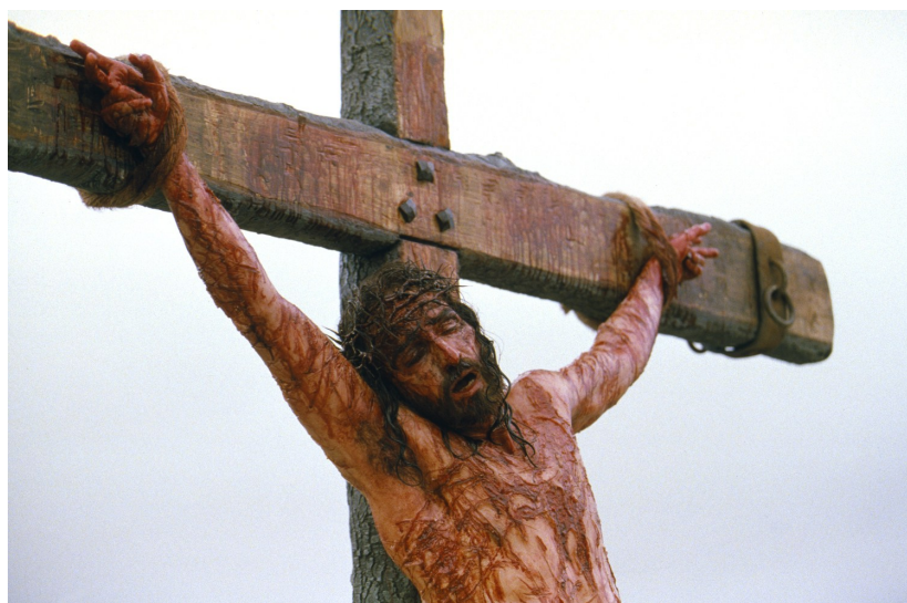
The Passion of Christ