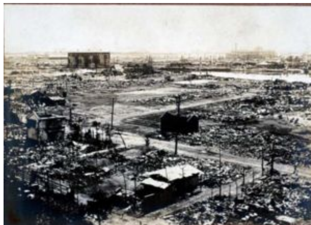
Earthquake destruction in Yokohama

Our house was destroyed; it was chaos. Fire started and we all climbed a mountain nearby... Even after nightfall, fire continued burning, making the sky red. The next morning, with my older brother, we went to see our house, which was burnt down. Some people were looking for something useful and we got mad, because they were stealing from our house... In the morning, everyone had a stick in their hand. So, I asked them why and they said it was because Koreans were causing trouble that we needed to punish them. I asked for one [stick] as well and with my older brother, we followed everyone. They were beating up Koreans and my brother and I also joined them [in beating]. When I hit one of them, he died (Keum 1989: 50).