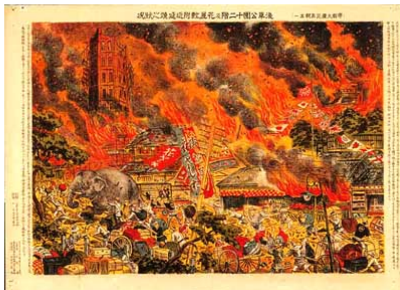
Fire spreading to the twelve-story tower in Asakusa Park and Hanayashiki Amusement Grounds, Tokyo

September 1, 1923, 11:58 a.m. The earthquake of magnitude 7.9 violently shook the Kanto region encompassing Tokyo, Kanagawa, Saitama, Chiba, and other prefectures. That day a total of 114 tremors were felt. In Tokyo alone, 187 major fires broke out, quickly wrapping the metropolis in flames, burning down homes, industrial facilities, and public infrastructure. The death toll reportedly exceeded 100,000. This was the Great Kanto Earthquake of 1923, the most dreaded memory of natural disaster of its kind in Japan to this date, far surpassing in its destructive power the January 1995 Great Hanshin-Awaji Earthquake that struck the Kobe region.