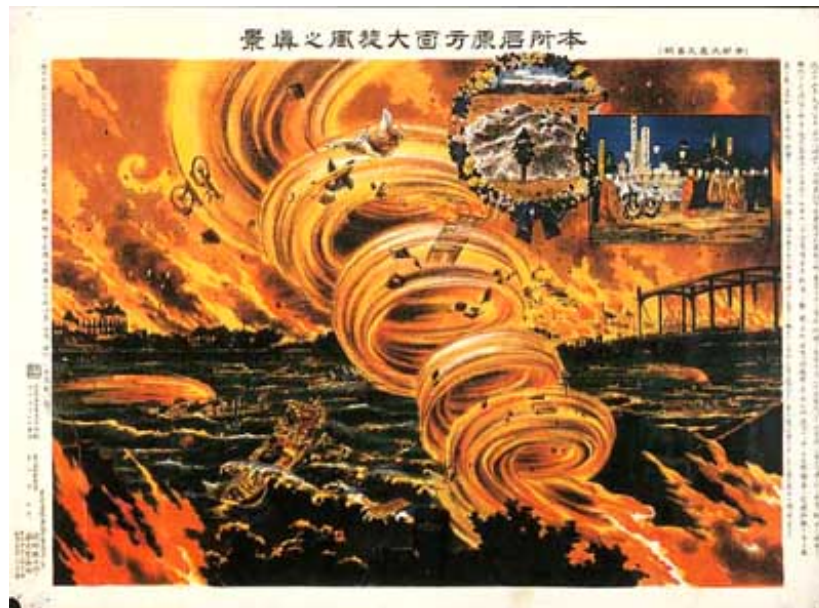
Sketch of a giant whirlwind toward Hongo-Ishihara