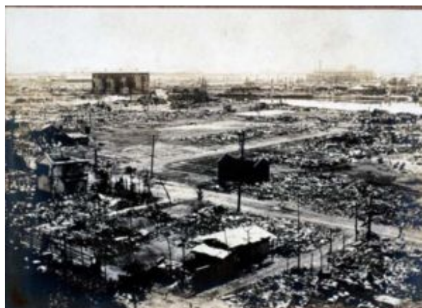
Earthquake destruction in Yokohama