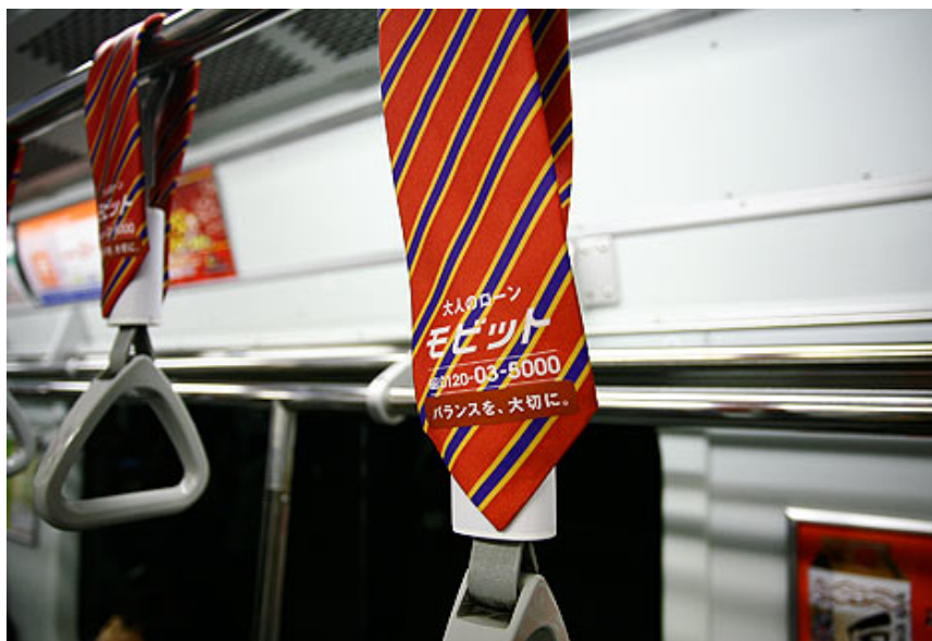
Subway ad for a loan company