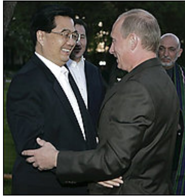
Hu Jintao (left) and Putin at Bishkek Summit

The SCO summit in Bishkek adopted a declaration on international security and stability, which contained thinly veiled criticism of the US global strategy. The declaration repudiated "unilateralism" and "double standards"; it emphasized "multilateralism", "strict observance of international law", and a lead role of the United Nations. Significantly, it said the SCO "always stood for strengthening strategic stability".