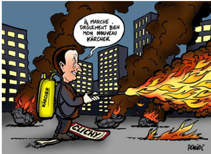
Cartoonist depicts Sarkozy's 2005 plan to clean up the projects with the new Kärcher cleaner

In 2005, while Sarkozy was minister of the interior, his comment about "social trash" triggered riots in suburban Paris. It is based on an extremely nihilistic view--which also suits his philosophy to strengthen supremacy--that it is inevitable that an economically liberal society produces social dropouts and a powerful mechanism is needed to "clean up" such "trash" that opposes the establishment.