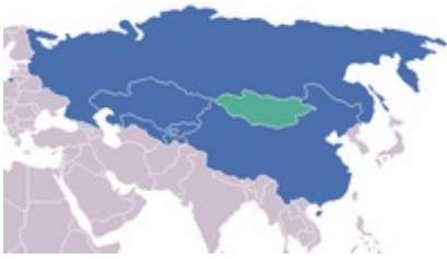
Map showing SCO military exercises centered on Xinjiang

The Chinese Ministry of Defense in a statement stressed that the exercises "do not target other countries and do not involve interests of countries outside the SCO". Briefing the media, the deputy commander of Russia's ground forces, General Vladimir Moltenskoj, also said the exercises were "not aimed at third countries".