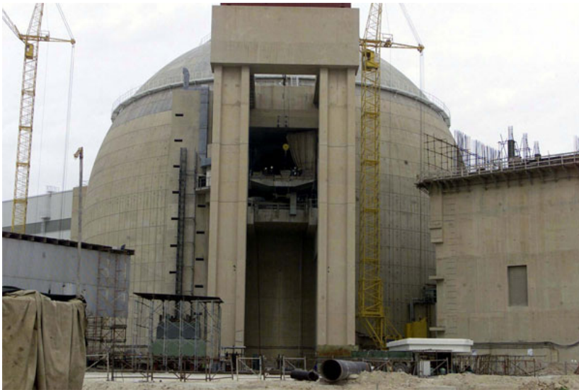
The main building of the Bushehr nuclear power plant (2003)

Besides, Russia has a great deal to gain by exploiting the agreement on civil nuclear cooperation with the US, signed on the sidelines of the "lobster summit" between Presidents George W Bush and Vladimir Putin on July 2, which is a major concession by Washington, allowing Russia to set up facilities for reprocessing spent nuclear fuel of US origin on commercial terms - a highly lucrative business indeed. In immediate terms, Washington's concession has opened the way for Russia to reprocess the spent fuel of US origin from South Korea and Taiwan.