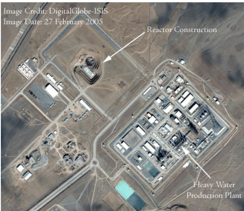
Arak heavy-water plant in 2005 satellite image

But at the same time, the fracas over Bushehr in a curious way gives Russia the handle to stall any further move by the US in the United Nations Security Council to push for a new sanctions resolution against Iran for not stopping its uranium-enrichment program. Moscow-based commentators have highlighted the current visit by International Atomic Energy Agency inspectors to the Arak heavy-water plant in Iran as a "real breakthrough" and as evidence that "Iranians are ready to give the IAEA exhaustive answers".