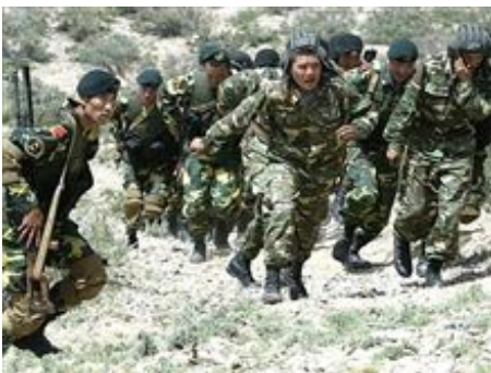
SCO military exercise in Kyrgyzstan

The exercises, code-named "Peace Mission 2007", will be held in Chelyabinsk in Russia's Volga-Ural military district and in Urumqi, capital of China's Xinjiang Uyghur autonomous region. The SCO summit is scheduled to take place in the Kyrgyz capital Bishkek on August 16. After the summit, in a highly symbolic gesture, the heads of states and defense ministers of all SCO members - China, Russia, Kazakhstan, Kyrgyzstan, Uzbekistan and Tajikistan - will watch the conclusion of the joint military exercise in Urumqi.