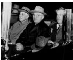
Roosevelt, Truman and Wallace

Throughout that first year, Henry Wallace, who Roosevelt had asked to stay on as Secretary of Commerce after Truman replaced him as Vice President, struggled valiantly to avert an arms race and ease the threat of nuclear war. When Wallace persisted in criticizing administration policy toward the Soviet Union and the bomb, Truman ousted him from the Cabinet. In his address to a national radio audience on the night he submitted his letter of resignation, Wallace again voiced the theme that provoked Truman’s ire, charging that the U.S. government’s present course may mean “the extinction of man and of the world.”[26] That Truman bears so much responsibility for creating this perilous state of affairs, regardless of his conscious intentions, justifies the application of such a harsh standard of judgment and demands a closer look at the man and his early presidency. For if Harry Truman, a relatively decent man, could behave so irresponsibly, what assurance is there that future presidents, under comparable circumstances, might not do the same? In fact, several have already come frighteningly close.