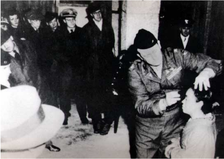
Atomic Bomb Casualty Commission examination

Many hibakusha remain incensed over their treatment by the Atomic Bomb Casualty Commission (ABCC), which the U.S. set up in Hiroshima in 1947 and Nagasaki in 1948 to examine but not treat the bomb victims.