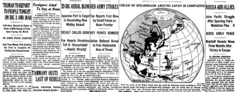
New York Times headlines Nagasaki bombing and Soviet entry into Manchuria, August 9, 1945

The U.S. had shown it could level Japanese cities almost at will in the months preceding Hiroshima. Whether the U.S. did so with hundreds of bombers or with one plane and one bomb did not fundamentally alter the strategic situation in the eyes of Japanese leaders. Even Army Minister Korechika Anami's startling announcement on August 9 that he had intelligence indicating that the U.S. might have more than 100 additional atomic bombs and that Tokyo would be the next target did not change the views of members of the War Cabinet who remained deadlocked 3-3 over whether to simply demand retention of the emperor system or to add three additional conditions.[49] While contradictory postwar statements by Emperor Hirohito and other Japanese leaders about whether the atomic bombings or the Soviet invasion ultimately proved decisive have provided ammunition for both sides in this debate, it seems clear that the powerful and rapidly advancing Soviet invasion definitively undermined both the Japanese military and diplomatic strategies far more profoundly and fundamentally than did the evisceration, however total and horrific, of the 65th and 66th destroyed Japanese cities. As Prime Minister Suzuki explained on August 13, when asked why they couldn't delay surrender for a few days, "If we miss today, the Soviet Union will take not only Manchuria, Korea, Karafuto, but also Hokkaido. This would destroy the foundation of Japan. We must end the war when we can deal with the United States."[50]