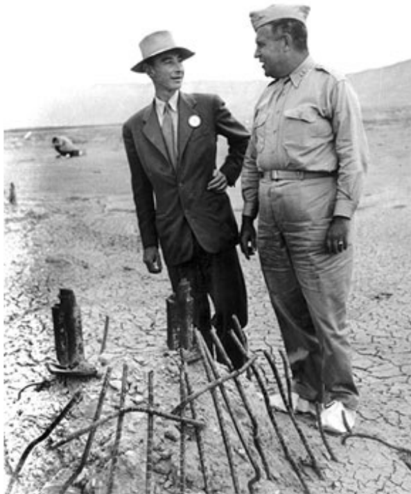
Oppenheimer and Leslie Groves at Trinity test site