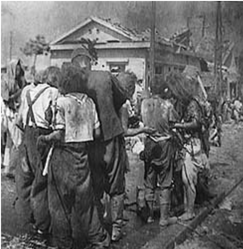
Hiroshima close up near the hypocenter three hours after the bomb

Survivors on the ground, however, unlike crew members flying above, vividly recall the flash from the bomb (pika), which signifies the beginning of the tragic narrative, and, when combined with the blast (don), left scores of thousands dead and dying and two cities in ruins. No wonder many Japanese refer to the bomb as pikadon and the mushroom cloud that so pervades the American consciousness has been superseded in Japan by images of the destruction of the two cities and the dead and dying.