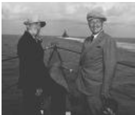
Truman and Byrnes en route to Potsdam, July 11, 1945

Three years later, with Hitler dead and the Nazis defeated, President Harry Truman faced a comparably weighty decision. He writes in his 1955 memoirs that, on the first full day of his presidency, James F. Byrnes told him the U.S. was building an explosive "great enough to destroy the whole world." [2] On April 25, 1945, Secretary of War Henry Stimson and Brigadier General Leslie Groves gave Truman a lengthy briefing in which Stimson reiterated the warning that "modern civilization might be completely destroyed" by atomic bombs and stressed that the future of mankind would be shaped by how such bombs were used and subsequently controlled or shared. [3] Truman recalled Stimson "gravely" expressing his uncertainty about whether the U.S. should ever use the bomb, "because he was afraid it was so powerful that it could end up destroying the whole world." Truman admitted that, listening to Stimson and Groves and reading Groves's accompanying memo, he "felt the same fear." [4]