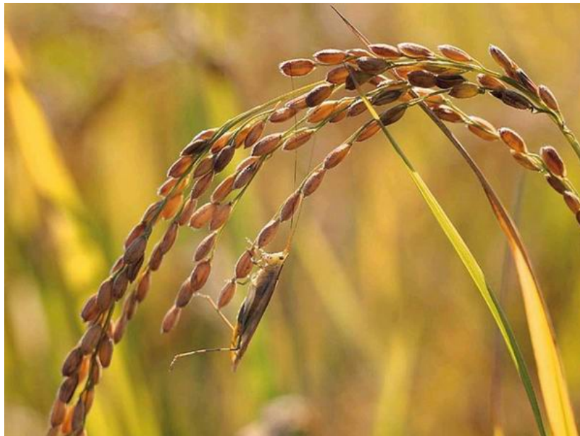
Rice is the first grass species to be sequenced

The environment in China for bio-research is particularly favorable right now due to the increasing number of Chinese researchers who have earned doctorates in Europe, the United States and Japan.