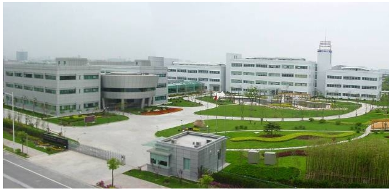
The Shanghai Center for Bioinformation Technology: “a corporate center with strong academic ties”

Meanwhile, the databank of NIG of Japan, set up to accept research results from Asian nations, has faced difficulties in obtaining registrations from foreign researchers. In 2000 and 2001, about 80 percent of applications for registration from China came to the Japanese databank. Since 2002, however, most of the Chinese researchers have applied for registration in the United States.