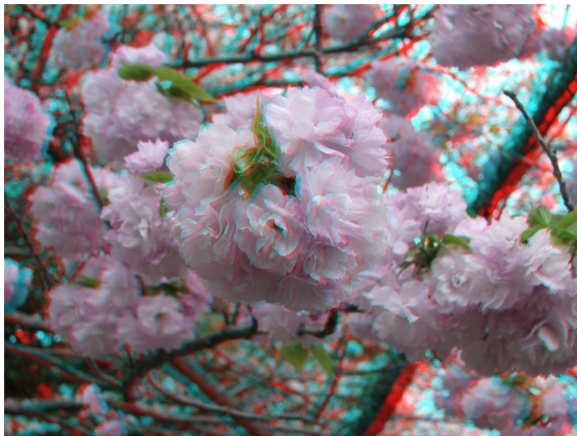
Cherry blossoms of Japan's National Institute of Genetics

The corresponding figure for Japan for the fiscal year ending March 2006 was 17.8 trillion yen, or 3.5 percent of GDP. However, China's expenditure outlays are rising by about 20 percent annually while Japan's have only grown slightly.