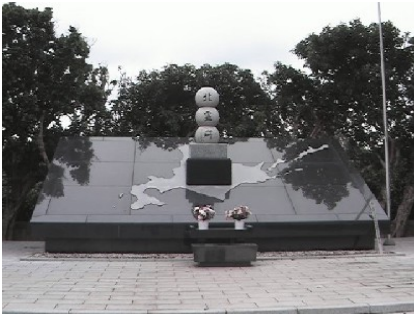
Fig. 2: Hokureihi—The monument to over 33,000 soldiers from Hokkaido who died in Okinawa and Southeast Asia. It is in a park in Itoman City, Okinawa, that contains other prefectural memorials a few kilometers from the Himeyuri memorial. It is maintained by the Hokkaido Rengo Izokukai.

Kakiuchi's book is just one illustration of the important but often overlooked role that family, friends and furusato (home town/area) have played in preserving and shaping Japanese memories of the Asia-Pacific War. The international media, and to some extent the academy, has tended to focus on "official" and "controversial" topics. [5] While controversies such as official prime ministerial worship at Yasukuni Shrine are undoubtedly important, this article employs a social rather than political or national history approach to examine how those things "closest to home"—particularly family, friends and furusato —shape Japanese memories of the Asia-Pacific War, 1937-45. It is a method that merits application to wars and war memories elsewhere, too.