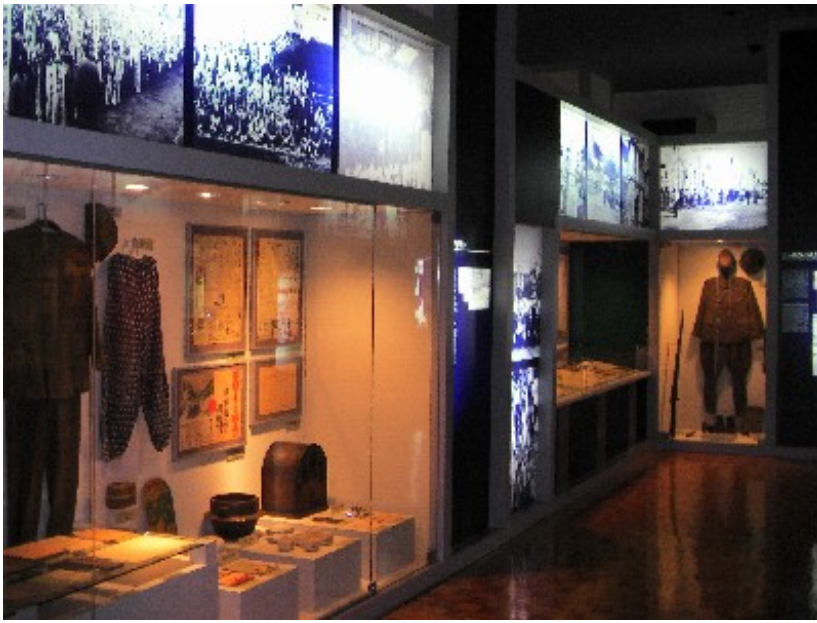
Figs. 8 and 9: "From Recession to World War II" exhibits in the Historical Museum of Hokkaido

The second important form of extra-curricular war education for Japanese children is listening to the testimony of a member of the war generation. As in most "peace education," the moral is "the terrible nature of war" and not a jingoistic defense of Japanese actions. The archetypal testimony at schools that is reported in the Japanese media is civilian testimony of air raids. For example, the Hokkaido Shinbun reported on 14 July 2006 that in Kushiro (one of the cities affected most by the Hokkaido air raids of 14-15 July 1945), survivors of the air raids had been speaking to children at elementary and junior high schools. [37]. But testimony of other military and civilian experiences can feature, too, provided that it fits within the school's definition of "peace education." In the same university student survey mentioned above, 11.2 per cent of the 436 students said that they had heard testimony from a member of the war generation invited to speak at their junior high school, while 18.6 per cent had heard such testimony at senior high school.