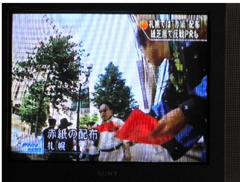
Fig. 15: Members of a citizens group hand out draft papers in Sapporo on 15 August 2005.

The same article also described how a citizens' group in Asahikawa handed out "draft papers" ( akagami ) to passers-by to remind people that during the war families could be separated without warning. This is an annual event that takes place in a number of other cities including Sapporo. One woman who received an akagami commented, "I had heard about receiving call up papers from my parents, but actually seeing one brings it home to you." Her grandson, meanwhile, said "forcefully" that he never wants to go to war. This thirteen-year-old boy's comments are indicative of the fact that, whatever the virtues or failings of the Japanese education system regarding the teaching of war history, many children know how to use the pervasive "war is bad" rhetoric from an early age.