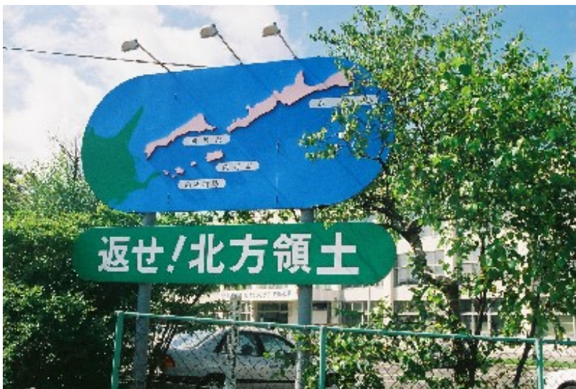
Fig. 6: A sign saying "Return the Northern Territories" outside a public building in Nemuro

Viewing war history from a local perspective illustrates that collective memories may vary considerably from furusato to furusato . In Hokkaido's case, the large number of forced laborers in the mines (20 per cent of all Korean and 42 per cent of all Chinese forced laborers in Japan were in Hokkaido [32]) have given narratives of forced labor greater prominence within local history than in other regions. The Soviet role in World War II also features much more prominently in Hokkaido memories compared to the rest of Japan, because many settlers from Manchuria and particularly Sakhalin were repatriated to Hokkaido, including many who spent time in Soviet camps. And the local campaigns to force Russia to return the Northern Territories (the island groups of Habomai, Shikotan, Kunashiri and Etorofu), which were occupied after Japan's surrender, are visible across Hokkaido on the placards outside official buildings, especially in the eastern city of Nemuro. The Northern Territories issue and its effects particularly on fishermen on Cape Nosappu (which at its closest point is only 3.7 kilometers from the Habomai island group) is an example of how aspects and legacies of war history that are of marginal importance in one region may be of day-to-day significance in another.