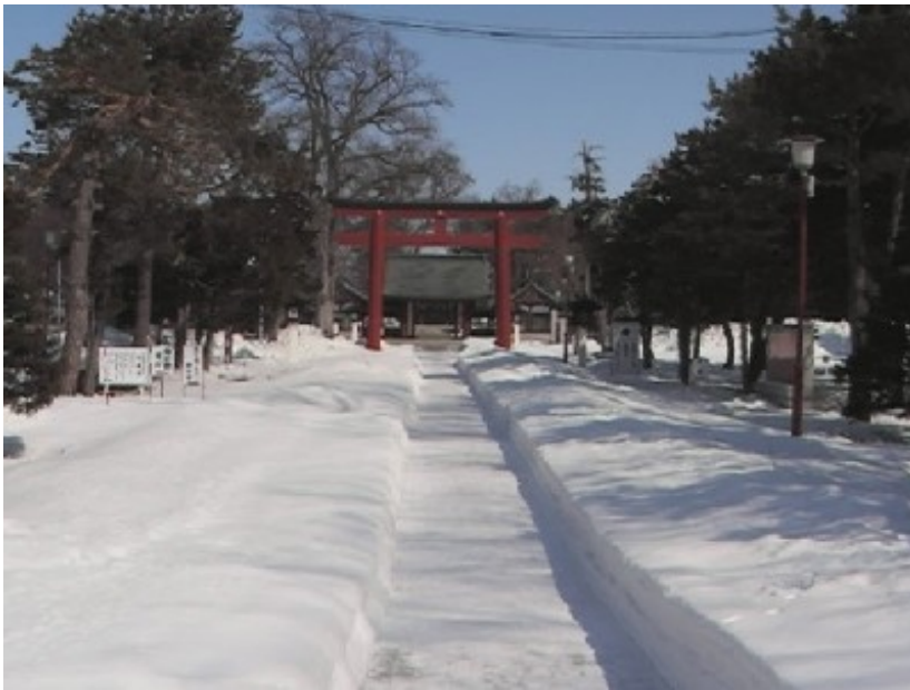
Figs. 3 and 4: Hokkaido Gokoku Jinja (Nation Protecting Shrine) in Asahikawa