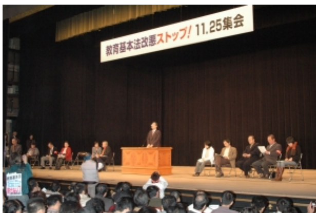
November, 2006 Teachers rally to oppose the revision of the Fundamental Law of Education

Educational reform, however, inevitably rings extra alarm bells in Japan, where many still remember that schools were once little more than the junior wings of the military. The Japan Times reminded its readers after Mr. Abe's speech that the original 1947 Law was based on the determination "of the Japanese state not to repeat the mistake of creating the ultranationalist, state-centered education system of World War II and before." In June it said the new education bills were "yet another means to strengthen state control."