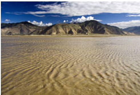
The Yarlong Tsangpo River in Tibet

While intrastate water-sharing disputes have become rife in several Asian countries — from India and Pakistan to Southeast Asia and China — it is the potential interstate conflict over river-water resources that should be of greater concern. This concern arises from Chinese attempts to dam or redirect the southward flow of river waters from the Tibetan plateau, where major rivers originate, including the Indus, the Mekong, the Yangtze, the Yellow, the Salween, the Brahmaputra, the Karnali and the Sutlej. Among Asia's mighty rivers, only the Ganges starts from the Indian side of the Himalayas.