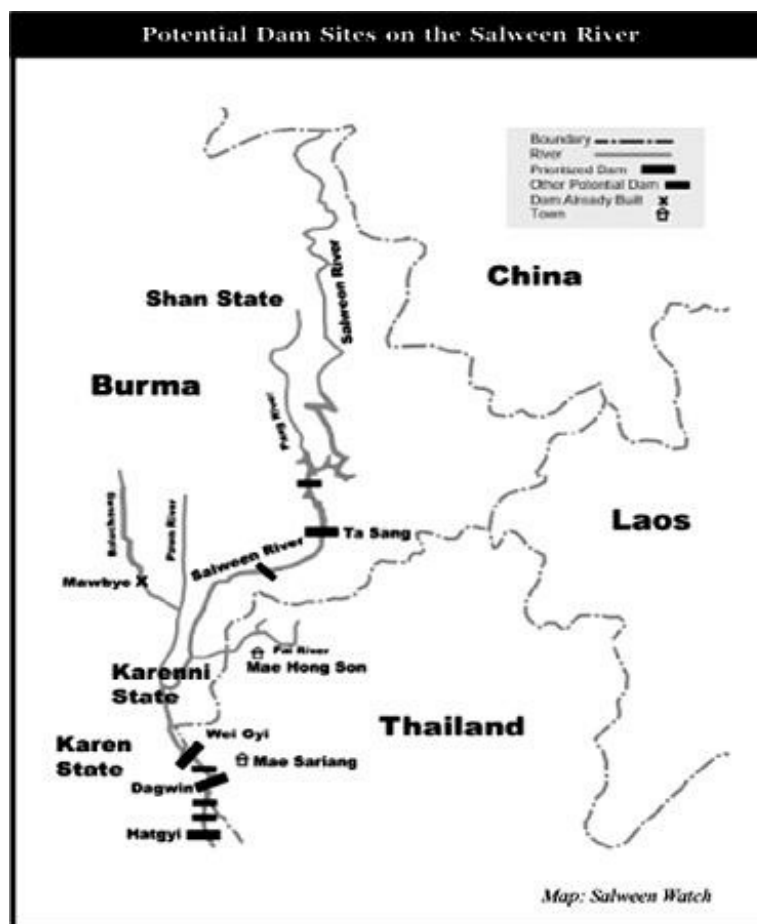
Map 2: Potential dam sites of the Salween River

Among advocacy NGOs concerned with environmental issues there has been considerable focus on the Three Parallel Rivers region already mentioned. This area was inscribed on the list of World Heritage sites in 2003 for its identity as the ‘epicentre of Chinese biodiversity’ which is ‘also one of the richest temperate regions of the world in terms of biodiversity’.[6] On the basis of a map published by the International Rivers Network, the designated Heritage area does not include the Nu itself, but rather is located close to the river’s right, or western bank, as well as taking in areas further east, close to the Mekong and the Yangtze. (See Map 1 entitled ‘Proposed dams along the Nu (Salween)’, showing the course of the Nu and the sites of proposed dams in China.)