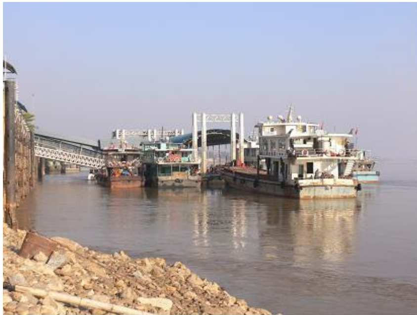
Photograph 2: Chinese vessels at Chiang Saen

used to bring Thai palm oil and sacks of soybean meal as backloading of the Chinese vessels for their return trip. A mobile crane was also in use for even heavier items than those picked up or delivered by truck. In the light of the current activity around this existing port, there are plans to build a further facility downstream from Chiang Saen, which will be capable of servicing vessels up to 500 DWT. [29] Although some of my informants spoke of work already being under way for this new port, with feasibility studies supposed to have been completed by 2006, I did not see any indication of this during my visit to Chiang Saen. (See Photograph 2 of Chinese vessels moored at the existing Chiang Saen facilities in January 2007.)