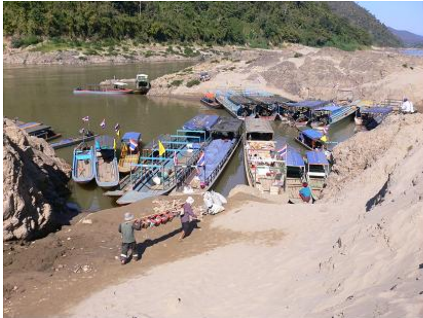
Photograph 1: Salween at Ban Sam Laep

when it flows through a largely flat, immediately surrounding landscape. Until it reaches its delta in Burma, the Salween flows almost entirely through sharply rising gorges on either side of its banks. In Tibet and western Yunnan some of these gorges rise to a height of 3,000 metres above the river. Even in the region where the Salween flows between Burma and Thailand, where the height of the surrounding gorges is much reduced, the topography is such that it still provides an ideal physical setting for dam construction. (See Photograph 1 of the Salween taken at Ban Sam Laep, on the left [Thai] bank, where the river forms the boundary between Thailand and Burma.)