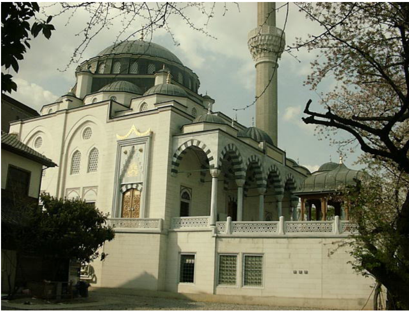
A Tokyo Mosque in Yoyogi

There are currently between 30 and 40 single-story mosques in Japan, plus another 100 or more apartment rooms set aside, in the absence of more suitable facilities, for prayers. Many Muslim communities have plans to build mosques in the near future.