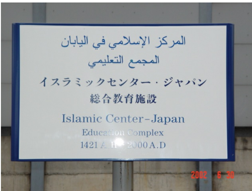
Islamic Center of Japan