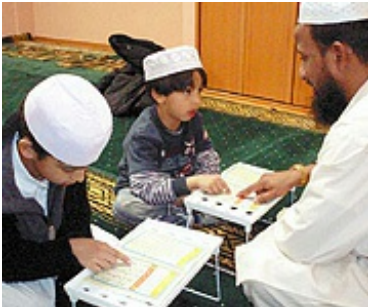
Children learn Arabic at the Yokohama Mosque

At the mosque in Ebina, Kanagawa Prefecture, about 10 children around age 10 are learning the Arabic alphabet. Every day from 4 pm to 8 pm, the mosque holds Koran classes. They started last November, at the urging of Pakistani and Bangladeshi Muslims living in the area who wanted their children to be properly versed in the ancestral religion and the Arabic language. The classes are taught by the parents themselves.