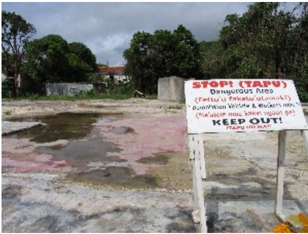
Sign erected after November 2006 riots