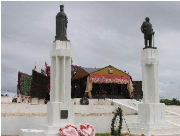
Tongan royal tombs