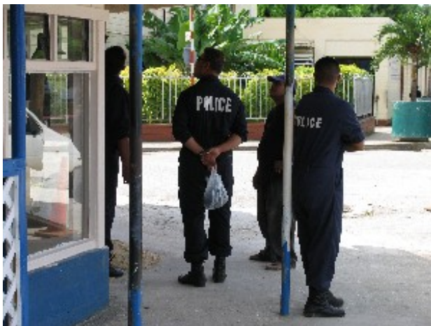
Police guard a corner in Nuku'alofa

“The Pro-democracy movement is also very dissatisfied with the religious leaders, who seem to be all too willing to extract funds from families, no matter how poor their members are. Our people are suffering. Inflation is high. The standard of living of Tongans is declining. We don't want to ignite the riots. We want to live peacefully. But there has to be some solution to the present problems. And patience is running out.”