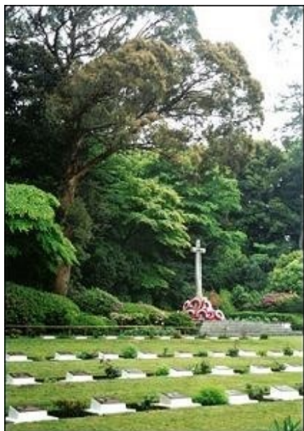
The Commonwealth War Cemetery near Yokohama contains the remains of nearly 300 Australian servicemen

While there were no charges of war crimes involving Camp 26, the paper trail for prisoner labor at Yoshikuma is clearly extensive. A 1982 book published by Japan's National Defense Academy also states that the camp's prisoners worked for Aso Mining.