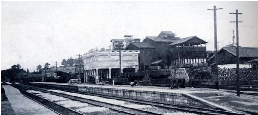
1933 photo of coal sorting equipment at Aso Yoshikuma mine in Keisen town, Fukuoka

(Also in 1945-46, Japan’s Foreign Ministry similarly directed companies to submit extensive records concerning forced labor in Japan by Chinese nationals, many of them undeclared prisoners of war. War crimes against Chinese forced laborers were for the most part not prosecuted, however. The Japanese government suppressed the so-called Foreign Ministry Report and lied to the Diet about its existence, which was finally confirmed in 1993. Tokyo today describes the Chinese labor program as “half-forced.”)