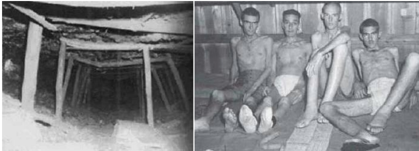
Dangerous conditions at the Mitsui Miike coal mine in Fukuoka and Allied POWs in Japan after liberation

Last year's flurry of media coverage reflected the nationalities of the World War II prisoners involved: 197 Australian, 101 British and two Dutch.