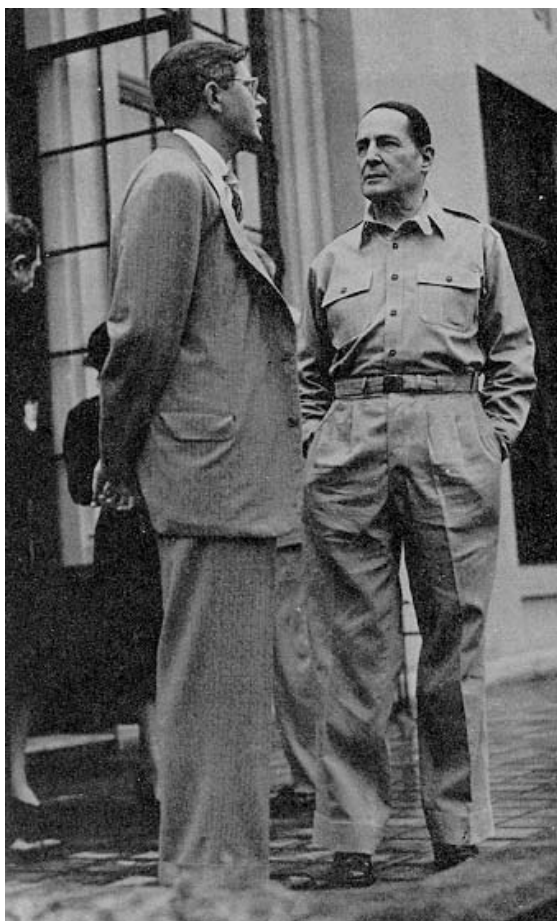
Norman and MacArthur

Softly chastised by Norman and the Far Eastern Commission, MacArthur unleashed a tirade, accusing the Commission of trying to undermine U.S. authority over Japan: "If we lose control of this sphere of influence under this policy of aggressive action, we will not only jeopardize the occupation but hazard the future safety of the United States." [19] Faced with MacArthur's wrath, the Canadian government declined to further challenge the rising American hegemon. As U.S. policymakers invoked anti-communism in their campaign for global influence, the Liberal regime in Ottawa aligned itself closely with Washington, subordinating international obligations to continental ties. On one level Norman appeared to embrace the U.S.-Canadian partnership and adopted the language of the Cold War (pointing out, however, that in Asia the war was a 'hot' war). But on other occasions he contested emerging policies.