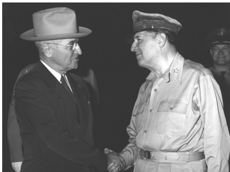
MacArthur and Truman, Wake Island, Oct 15, 1950