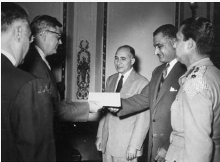
Norman presents his credentials as Canadian Ambassador to Gambel Nasser

Norman's appointment as ambassador to Egypt in 1956 was the beginning of his comeback and coincided with the outbreak of the Suez Crisis. Exhausted by his part in advocating for a U.N. peacekeeping mission (for which Lester Pearson won the Nobel Peace Prize), Norman was suddenly faced with renewed U.S. charges. He opted to end his life rather than face continued persecution.[1]