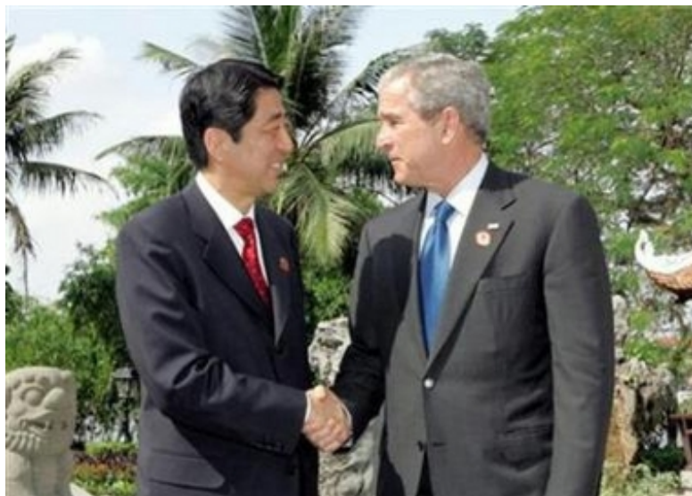
US President George Bush and Japanese Prime Minister Abe Shinzo in Hanoi November 18, 2006.

The Japanese Prime Minister seems most concerned not to offend the Bush administration. Thus the incongruous spectacle of him in Washington offering to President Bush a carefully-worded expression of regret about the Comfort Women, which President Bush in turn "accepted" and praised, as if he somehow represented the women whom Abe steadfastly has refused to meet and whom he apparently views as liars.