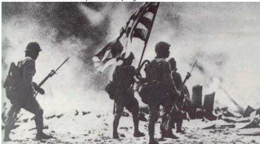
Japanese marine attack Rabaul in 1942.

From late 1942 Australians knew that the Japanese had shipped women to Rabaul where they worked in brothels catering for Japanese troops. Japanese captured on the Kokoda Track and elsewhere described the brothels, and New Guineans who had been in Rabaul talked about them. Australian military and civilian prisoners saw the brothels, and a few of those Australians observed them over a long period. Japanese who served in Rabaul have left reminiscences about the brothels and one Korean woman has testified that she worked in Rabaul. As a result, there is scattered material on perhaps 3000 comfort women in an Australian Territory, but when Australian reporters and commentators need to give the comfort women an Australian relevance, these women are never mentioned. Their experiences are not used to provide evidence on the recurring debates about whether the comfort women were coerced or free and whether they were recruited, shipped and employed by private contractors rather than the Japanese military or government.