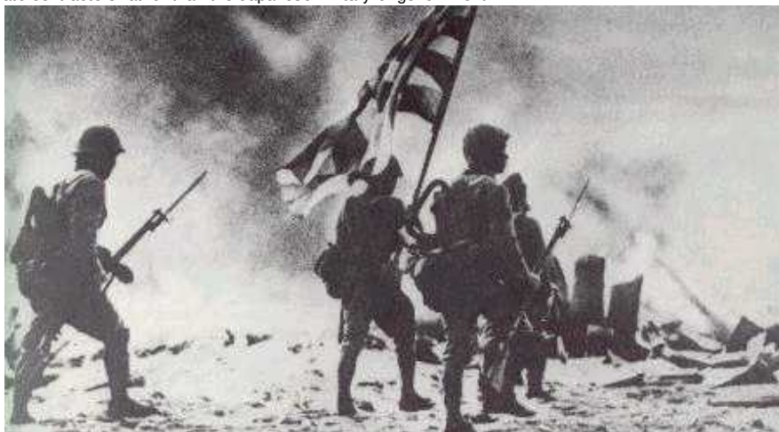
Japanese marine attack Rabaul in 1942.

From late 1942 Australians knew that the Japanese had shipped women to Rabaul where they worked in brothels catering for Japanese troops. Japanese captured on the Kokoda Track and elsewhere described the brothels, and New Guineans who had been in Rabaul talked about them. Australian military and civilian prisoners saw the brothels, and a few of those Australians observed them over a long period. Japanese who served in Rabaul have left reminiscences about the brothels and one Korean woman has testified that she worked in Rabaul. As a result, there is scattered material on perhaps 3000 comfort women in an Australian Territory, but when Australian reporters and commentators need to give the comfort women an Australian relevance, these women are never mentioned. Their experiences are not used to provide evidence on the recurring debates about whether the comfort women were coerced or free and whether they were recruited, shipped and employed by private contractors rather than the Japanese military or government.