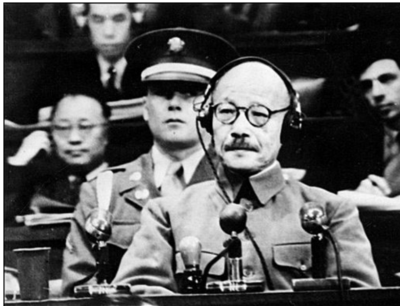
Prime Minister Tojo Hideki at Tokyo Trial

German and Japanese War Crimes Tribunals, and the 1949 Geneva Accords and its 1977 Protocol. The Nuremberg Indictment defined "crimes against humanity" as "murder, extermination, enslavement, deportation, and other inhumane acts committed against any civilian population, before or during the war," language that resonated powerfully with the area bombing campaigns not only of Japan and Germany but of Britain and the US. [38] These efforts appear to have done little to stay the hand of power. Indeed, while the atomic bomb would leave a deep imprint on the collective consciousness of the twentieth century, memory of the area bombings and firebombing of major cities soon disappeared from the consciousness of all but the victims.