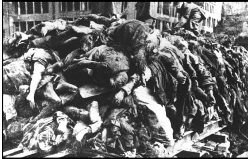
Dresden. Bodies found beneath wreckage