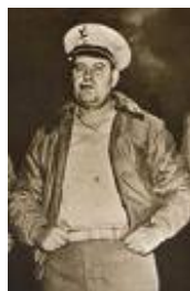
Curtis LeMay in the 1940s

Following the attack, LeMay, never one to mince words, said that he wanted Tokyo "burned down—wiped right off the map" to "shorten the war." Tokyo did burn. Subsequent raids brought the devastated area of Tokyo to more than 56 square miles, provoking the flight of millions of refugees.