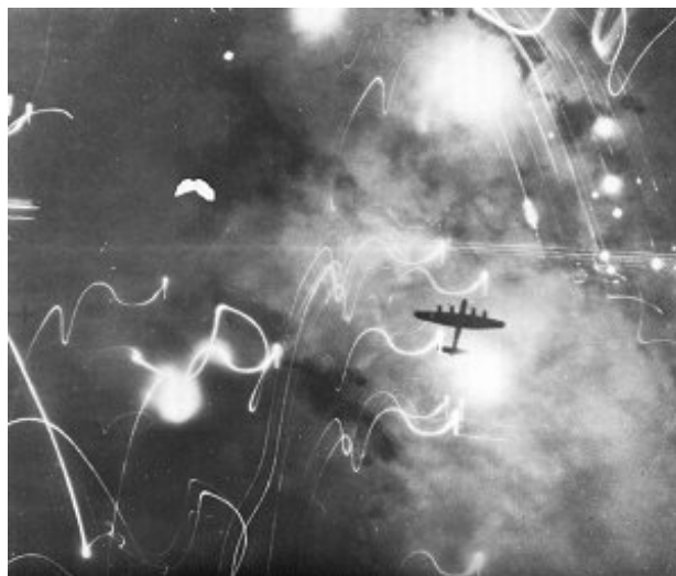
Hamburg seen from 18,000 feet on July 28, 1943

After entering the war following Pearl Harbor, the US continued to claim the moral high ground by abjuring civilian bombing. This stance was consistent with the prevailing view in the Air Force high command that the most efficient bombing strategies were those that pinpointed destruction of enemy forces and installations, factories, and railroads, not those designed to terrorize or kill noncombatants. Nevertheless, the US collaborated with indiscriminate bombing at Casablanca in 1943, when a US-British division of labor emerged in which the British conducted the indiscriminate bombing of cities and the US sought to destroy military and industrial targets. [11] In the final years of the war, Max Hastings observed that Churchill and his bomber commander Arthur Harris set out to concentrate "all available forces for the progressive, systematic destruction of the urban areas of the Reich, city block by city block, factory by factory, until the enemy became a nation of troglodytes, scratching in the ruins." [12] British strategists were convinced that the destruction of cities by night area bombing attacks would break the morale of German civilians while crippling war production. From 1942 with the bombing of Lubeck followed by Cologne, Hamburg and others, Harris pursued this strategy. The perfection of onslaught from the air, or what should be understood as terror bombing, is better understood, however, as a British-American joint venture.