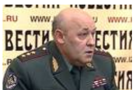
Gen. Yury Baluyevsky

But Russia's top brass reacted swiftly to Gates' upbeat tone, maintaining that the proposed US deployments in Central Europe are aimed at Russia and that there is hardly any scope for cooperation. The chief of the Russian General Staff, General Yury Baluyevsky, said: "The real goal [of the US deployment] is to protect [the US] from Russian and Chinese nuclear-missile potential and to create exclusive conditions for the invulnerability of the United States."