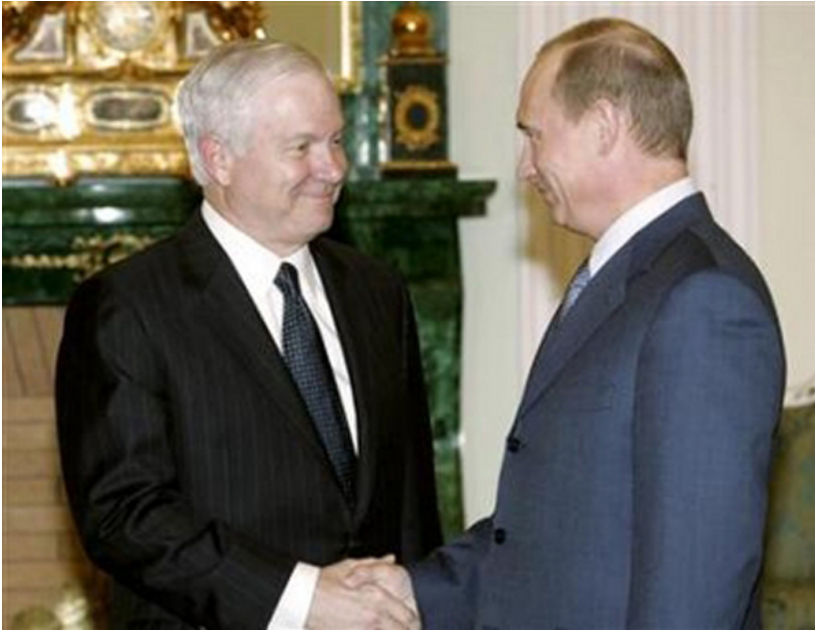
Gates and Putin in Moscow

Hardly had Yeltsin, archetypal symbol of post-Soviet Russia's "Westernism", departed than Gates, one of spymaster John le Carre's "Smiley's people", arrived on a mission to let the Kremlin know that no matter Russian sensitivities, Washington was going ahead with its deployment of missile-defense systems along Russia's borders. Gates reminded the Russians how little had changed since the collapse of the Soviet Union in 1991.