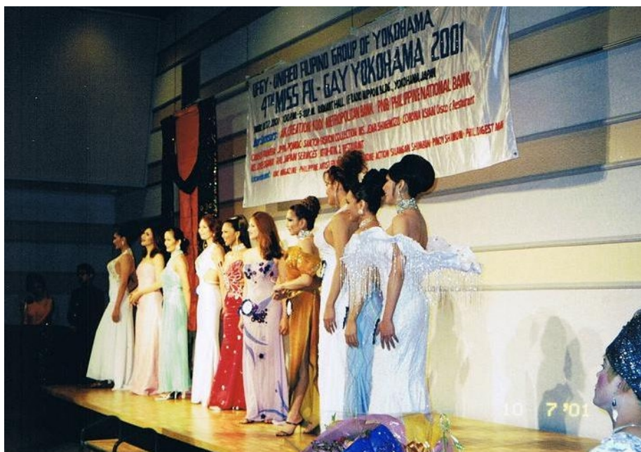
Figure 3: Filipino Hostess and Host Club Workers Participating in a “Miss Fil-Gay” (Filipino Gay) Beauty Pageant