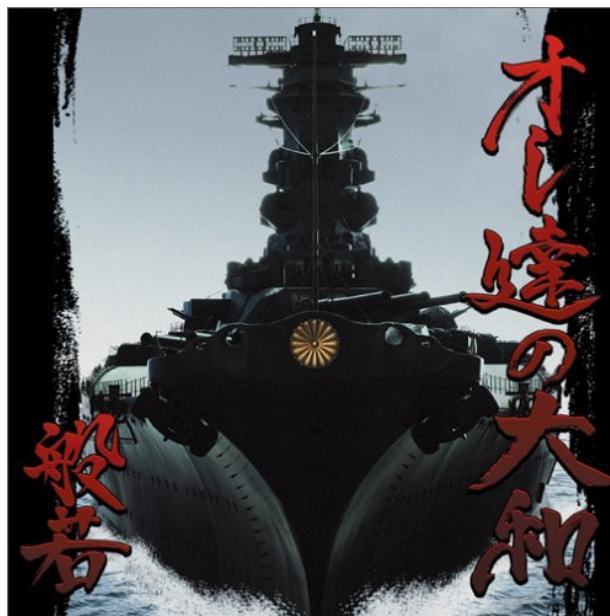
Hannya (2005) Oretachi no Yamato (Avex, Japan [single release])

Hip-hop illustrates both the opportunities and dangers of media, exemplifying both progressive protest and commercial hedonism, but also notable for the ways that sampling and rapping provoke an interrogation of the pieces of history we use to construct ourselves and our expressions. As I discuss in the book Hip-Hop Japan , Japanese rappers explore issues of Japanese history text books, the similarities between Hiroshima and 9/11, and the tragedies of the recent wars in Afghanistan and Iraq (Condry 2006). Hannya's song "Oretachi no Yamato" (our Yamato) was written as a tribute to the film Otokotachi no Yamato . What makes Hannya's song so interesting is the way it uses the sinking of the Yamato as an opportunity to examine not the masculinity of military sacrifice ("the men's" or otokotachi of the film's title) but what the sinking means for "us" ( oretachi ), that is, today's Japanese youth.