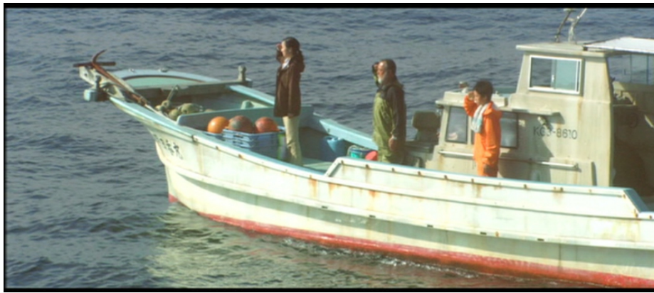
Figure 3: Scene from Otokotachi no Yamato (2005, Dir. Sato) in which three generations unite in saluting the fallen dead of World War II

But how effective is the graphic portrayal of the Yamato's demise as an argument for Japanese patriotism? Hannya's song, which explicitly invokes the film (e.g., using the same digital image of the battleship for the cover of his single) suggests that the lessons can in fact run counter to the kinds of interpretations that Ishihara and other nationalists would expect.