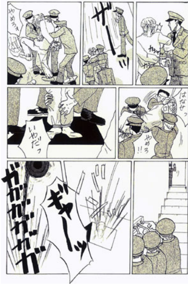
The guards' perspective: Prison officers blindfold and handcuff the condemned inmate, put a rope around his neck and position him standing on the trapdoor of the gallows. On a signal, three guards then press buttons that open the trapdoor.