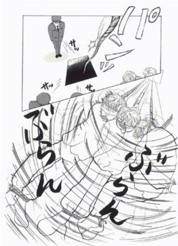
Job done: The trapdoor opens and the inmate is hanged.