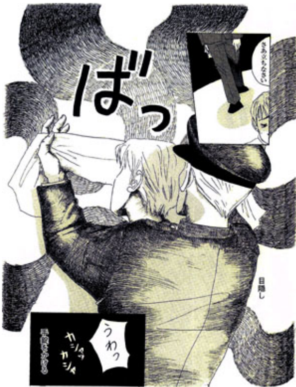
The last breath: Having written his final letter, the inmate is blindfolded, handcuffed and bound around the ankles, with death now only moments away.