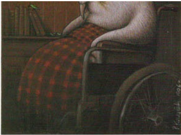
Pawel Kuczynski: Poland