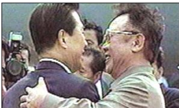
Kim Dae Jung and Kim Jong Il at 2000 summit in Pyongyang

The Kim Dae Jung government came to power in South Korea in 1998 seeking to open South-North relations under the "Sunshine" policy. The realization of the South-North summit of 2000 brought great change. US-North Korea relations were also affected. North Korea's Number Two, Choe Myong-rok, visited Washington and Secretary of State Madeleine Albright visited North Korea. The moment was reached when a visit by President Clinton to North Korea might have decisively pushed the relationship towards normalization. That visit did not, however, materialize.