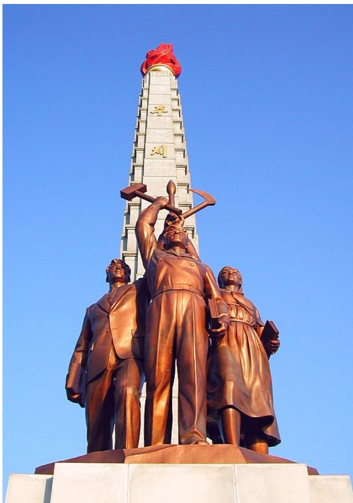
Korean monument to Sure Victory

In the 1980s, South Korea achieved democratization, gained economic power, stabilized its system, and successfully staged the 1988 Olympics. The pressure it exerted on North Korea reached a peak. North Korea's response seems to have been the destruction of the KAL airliner in 1987. When the Soviet Union proceeded to open diplomatic relations with South Korea, it meant that North Korea was deprived of its nuclear umbrella protection. On 2 September 1990, North Korean Foreign Minister Kim Yong-Nam told visiting Soviet Foreign Minister Shevardnadze that since the Soviet-North Korean treaty no longer had any substance, "henceforth we will have to take steps to supply ourselves with the few weapons that till now we have relied on the alliance for." (Asahi Shimbun, 1 January 1991)