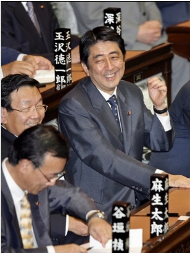
Prime Minister Abe at the Diet

On March 1 Japanese Prime Minister Abe Shinzo responded to the Congress resolution by commenting that there was "no evidence" that the recruitment of "comfort women" had been "forcible in the narrow sense of the word". Speaking during a Diet committee debate a few days later, he reiterated this statement, clarifying the fact that, to be "forcible in the narrow sense of the word" the system would have had to involve "officials forcing their way into houses like kidnappers and taking people away". [3] Abe, however, clearly has no problem with the proposition that the recruitment of "comfort women" was forcible "in the broad sense of the word", and feels no historical responsibility for this, since he has made it clear that he and his government will not apologise whatever the outcome of the US Congressional resolution. [4] His Foreign Minister Aso Taro, has also attacked the US resolution, saying that it is "not based on the facts". [5]