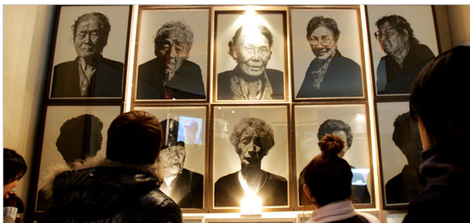
Japanese student in Seoul view exhibit showing photographs of former 'comfort women'

Between December 1991 and August 1993 the Japanese government conducted its own investigation of the comfort women issue. [9] On the basis of its findings, Japanese Chief Cabinet Secretary Kono Yohei issued a statement on 4 August 1993 in which he stated that "The recruitment of the comfort women was conducted mainly by private recruiters who acted in response to the request of the military. The Government study has revealed that in many cases they were recruited against their own will, through coaxing, coercion, etc., and that, at times, administrative/military personnel directly took part in the recruitments. They lived in misery at comfort stations under a coercive atmosphere."