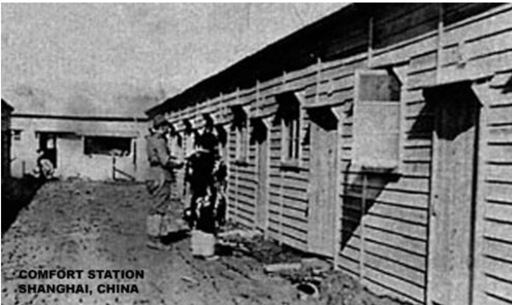
Military Comfort Station, Shanghai

Though there is much confusion and controversy over the history of the "comfort stations", certain facts are clear. Military brothels were created all over the occupied areas of Asia during the war for the use of Japanese soldiers: the first were set up as early as 1932, but most were created after the outbreak of full-scale fighting in China in 1937. Some of these were managed by civilians for profit, but frequented by members of the Japanese armed forces; others were established and run directly by the Japanese military. Former Prime Minister Nakasone recalls in his memoirs authorizing the building of a "comfort station" on the island of Borneo for the use of men in his Naval Corps. [7]