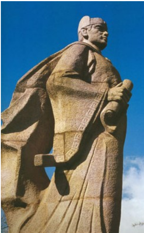
Statue of Chinese admiral Zheng He (1405-1433)

During the first decades of the fifteenth century, the famous expeditions by Admiral Zhenghe not only crossed the South Seas but went as far as India, Mecca, and even Mogadishu in Africa. They were broken off after 1436, and this interruption has generally been interpreted as a Chinese desire to “withdraw”. This still remains to be proven, for the stopping of the great State expeditions in no way meant Chinese emigration ceased. We can indeed wonder if, fundamentally, the Chinese had not moved on very much earlier to a system of private trading (so vaunted in our days), while the West still remained entangled in its “companies”, who made war on “freebooters” for a further two or three centuries.