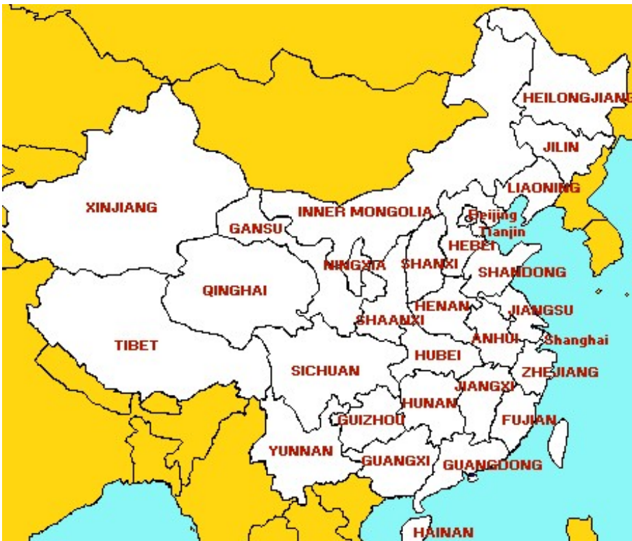
Map of administrative divisions in China

At this point, we can affirm that wanting to understand Southeast Asia without integrating a good deal of southern China into our thinking is like wanting to give an account of the Mediterranean world after removing Turkey, the Levant, Palestine, and Egypt. By this new “centring”—or rather, by restoring the centring—geography can and should help us to go beyond the received ideas that a certain style of history wants to us preserve, by insisting on staying too close to the facts (or to certain facts).