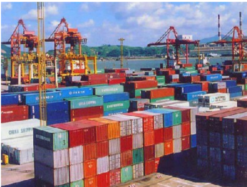
Containers at Fuzhou port

From the sixteenth century, things changed a bit, partly due to the presence of Europeans—the Portuguese, and then the Dutch and English—but only in part for this reason. Little by little, Fujian’s primacy was receding and Canton taking back her former place, but under a less liberal system: 13 hang , or guilds, were set up there in 1557, and in 1720 they would begin the Kohong system that allowed Chinese mandarins better control of Westerners. One might reflect from this that, whenever China opens up via Canton, it is always done less widely and in a more controlled fashion than through Fujianese ports.