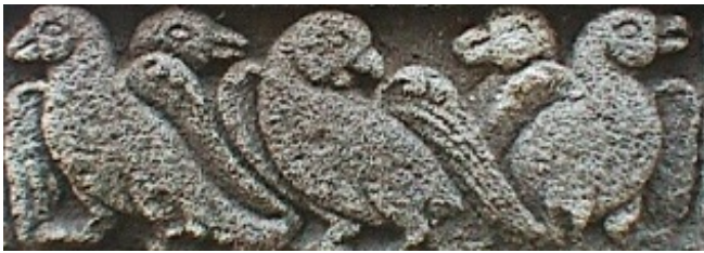
Borobudur / Detail of frieze depicting parrots

From the tenth and eleventh centuries, we can make out certain changes. In China, the period known as the Five Dynasties (907-960 CE) was characterised by a great level of autonomy in the southern regions, which took advantage of the temporary imperial crisis. Fujian, known for some decades as the kingdom of Min, [13] took off economically, little by little preparing itself to become one of the early economic motors of Southeast Asia; while under the Southern Han (Nan Han) the Guangdong region experienced enormous development, notably in regard to metallurgical production. In the archipelago that later became the Philippines, we see the emergence of the gold-rich site of Butuan (on the north coast of Mindanao), which starts to exchange Chinese ceramics for its gold. On Java, the centre of gravity moves from the middle to the east; and in the area of modern northern Vietnam, finally freed from Chinese control, war begins with the Chams to the south. This conflict would end with the Cham withdrawal, thus causing the western trade route, which had made possible the first contacts with India, with maritime Buddhism, and with Islam, to become unproductive for a long time.