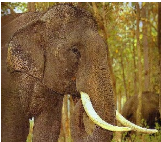
Elephant in southern Yunnan

That said, however, it is obvious that we are not going to find in this Southeast Asian "Mediterranean", thus defined, all the elements of the original. For example, we only need to glance at the map to understand that it is very much more open to the two great oceans that adjoin it, the Indian and the Pacific, and in contrast that it is very much more empty, with no island here playing the role of "staging post", as Cyprus, Crete, Malta or even Sicily did in times past. The obvious candidate is the Paracels, but they were located within a dangerous zone that early navigators preferred to skirt around rather than go through directly; and the astonishing international game that now breaks out from time to time over these miniscule islets, which are the Xisha (Paracels) or the Nansha (Spratleys), can only be explained by the oil reserves discovered there, quite recently on the temporal scale we are using here.