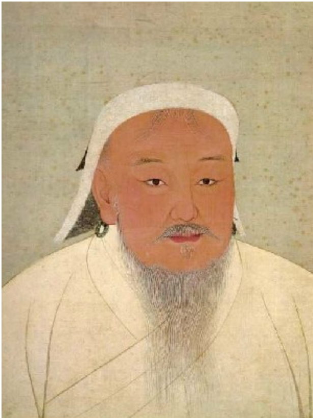
Painting of Khubilai Khan

However, the great turning point for Southeast Asia, as in fact for all of Eurasia, occurred in the thirteenth century, with the "Mongol moment" in world history, [14] and then in the fourteenth century when, almost immediately after, unrest in the Turkish principalities of Central Asia closed the continental trade route that Marco Polo and Rubriquis had taken (as well as Rabban Sauma, from the other way around). From this era, the "weight of the North" (that is to say, from southern China) scarcely ceased to prevail in Southeast Asia. Until then, the main impacts, whether Buddhist or Muslim, had in reality mostly come from the southwest, with "Indianisation" easily forming the most important such phenomenon. But, henceforth, Chinese ports would make the most obvious impact. From the thirteenth century, there was a Chinese community at Angkor; in the fourteenth century, there were Chinese settled in Siam who founded the new commercial city of Ayutthaya, [15] while we also hear at that time of communities established on the north coast of Java, notably at Gresik.