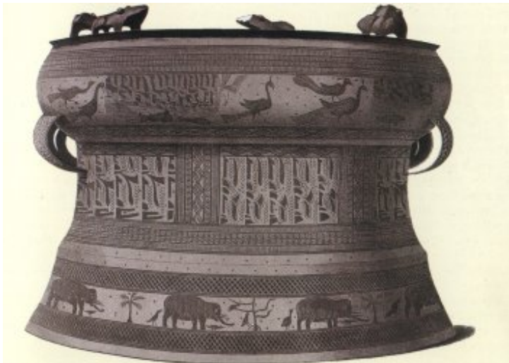
Dongson drum probably made in Vietnam circa 200 A.D.

This objection notwithstanding, it does not mean there cannot be found in Southeast Asia elements of an ancient common cultural foundation, beginning with an ancestral cult, linked to that of the buffalo, which can be detected from the south of China to as far away as Indochina, the Philippines, and Indonesia. During the prehistoric epoch (that is, a period broadly corresponding with the Roman era in the West and the Han in China), the discovery of an impressive number of bronze drums provides us with the outline of what is called Dongson culture, reaching west from the bronze rich southwest of China to the borders of Iran, and to the south passing through Vietnam, Malaysia, Sumatra, Java, Bali, Sumbawa, etc. That other technical information, like the use of braced ridge tiles, [7] could also have spread along with bronze working cannot be doubted. Some pre-historians are currently researching the presence of boat-coffins, found equally in Wuyishan, one of the highest places in northern Fujian, in the Niah cave (northern Borneo), and in several places in the Philippines.[8] Generations of students of mythology have also studied the similarities found among the various folklores of river-valley dwellers.