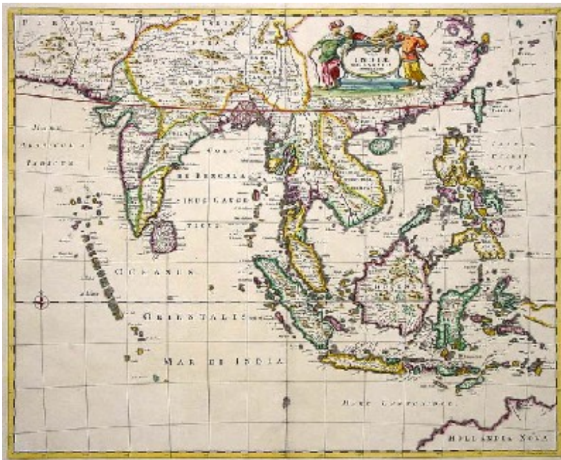
Map of the "East Indies," circa 1662

This perception is reflected more or less clearly in all the successive histories of Southeast Asia. Initially written from a colonial perspective, and later from a nationalist one, in either case they were marked by a strong desire to stress that the greatest influences came from the West: first of all "Indianisation", then "Islamisation" (conceived essentially as coming from Islamised India, or from the Middle East), and finally, of course, "Westernisation", after the early sixteenth-century arrival of the Portuguese. Written originally by Europeans, and aiming above all to teach readers to look to Europe (and later the US), these histories minimised the rhythms coming from the North to very little indeed, except for the Japanese commotion of 1942 which, even so, was rightly related as a totally unforeseen and even aberrant cataclysm.