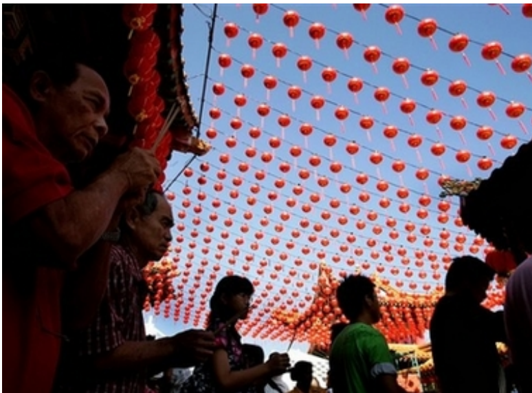
Ethnic Chinese offer prayers at a temple in Kuala Lumpur, February 2007

In this sort of perspective, the Southeast Asian space naturally remains open to the Indian world, beyond the Gulf of Bengal (which we know had been an area of exchange between Sri Lanka and Burma, as well as between Bengal and Arakan), as well as towards the Melanesian world (which we know begins in Indonesian itself, in Maluku, Irian and Timor). Yet, by contrast, it excludes all relations with the Chinese world. No thought is given here to trying to rethink over the centuries [in the longue durée ] the possible contacts between south China and Southeast Asia; at best, historical consideration was confined to the recently formed Chinatowns , which in turn were deliberately seen as settlements of "foreigners", and thus as an epiphyte...[3]