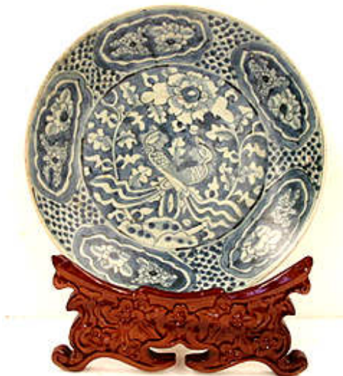
Early Ming plate found on shipwreck near Temate, Moluccas, eastern Indonesia

Guilaine's book about the origins of "our" Mediterranean [11]). There is every reason to think that it stayed that way even longer, and that coastal navigation routes, extending from port to port and finally ending up by linking all shores together, took a little longer to establish there. We can put together a rough chronology of the establishment of these trade routes, by analysing certain texts, initially mainly Arabic and Chinese ones, but also in particular by using the data of Chinese ceramic exports, which can be found on all the shores and which have been well studied in recent decades.