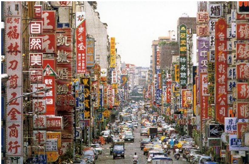
Postcard image of Taiwan

As for the two large islands of Hainan and Taiwan, which are like anchors cast out to sea from the Chinese continent, it is quite fascinating to compare their evolution. Both were initially occupied by non-Chinese populations, in the first case by Thais especially and by Austronesians in the second, so we could say that, from a certain perspective, they were both at base "Southeast Asian". But if Hainan was Sinicised quite early and has never ceased to form part of the continental system, Taiwan was not really occupied before the seventeenth century, above all by farmers from Fujian; and we know what its recent evolution has been.