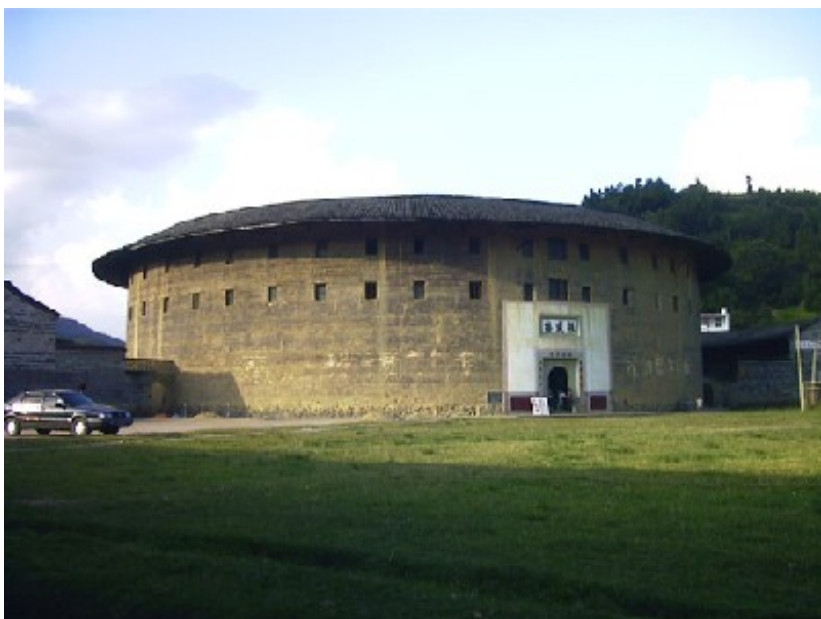
Hakka dwelling in southern Fujian

Finally, it is appropriate to note the work at present being carried out with great enthusiasm by many anthropologists, Chinese as well as western, on the Hakkas. We know that these "guests" (that is the sense of their name in Chinese: hakka or kejia in mandarin) were formerly always considered as a more or less Han people, come from the North largely in the Sung period, who had settled in southern regions. Their "difference" from other such groups, it used to be said, was in their wonderful ability to preserve their original traditions (and dialect). But today the tendency is to view them as "aborigines", as people of the South, who had been progressively but incompletely acculturated by Han civilisation. [9] And it is very true that certain of their customs (for example, double funerals) are better explained by the existence of an "old Southeast Asian stock" than by any import from the North. [10]