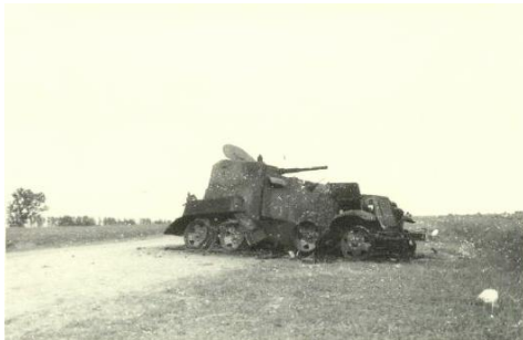
Soviet armoured vehicle during the Battle of Khalkhin Gol

In stark contrast, Japan's relations with other Northeast Asian neighbors, except Taiwan, are tense or often uneasy at best. Japan has no diplomatic relations with North Korea. Anti-Japan feelings still run deep among many people in China and South Korea, where Japan's wartime aggression and atrocities are still bitterly remembered.