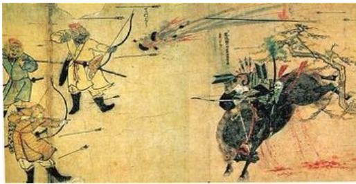
The samurai Suenaga facing Mongol arrows and bombs. Moko Shurai Ekotoba , circa 1293.

There are other reasons for Japan to place great emphasis on relations with Mongolia.