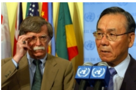
Japan's UN Ambassador Kenzo Oshima (R) and his then US counterpart, John Bolton at the UN HQ in August 2006.

Japan held a two-year rotating non-permanent council seat through the end of last year. But Tokyo has been keen on returning to the council as soon as possible to influence decisions on regional and global security concerns, especially North Korea's nuclear and missile programs. Non-permanent seats cannot be held for consecutive terms.