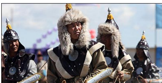
Genghis Khan 800th anniversary

Last year, Mongolia celebrated the 800th anniversary of Genghis Khan establishing the Mongol empire in 1206. In conjunction with this anniversary, Japan and Mongolia designated 2006 as “The Year of Mongolia in Japan” and 2007 as “The Year of Japan in Mongolia.” The legacy of Genghis Khan has been invoked in Mongolia in an attempt to foster national pride.