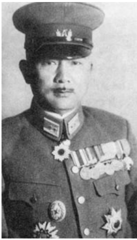
Lt. General Kuribayashi

You realize that Eastwood has made a highly unusual war movie right from the beginning of Flags of Our Fathers , when the US Navy steams toward Iwo Jima in full force. Not yet realizing quite what's in store for them, the young soldiers still have time to cheer the US bombers streaking overhead, as though they are at a football game—just as the audience is invited to do in more conventional pictures. One man, in his excitement, falls overboard. The good-natured laughter of his buddies suddenly freezes when they realize that no ship is going to stop for one individual Marine thrashing about in the ocean. The war machine rolls on. "So much for leaving no man behind," mutters "Doc" (Ryan Phillippe) under his breath.