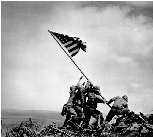
Joe Rosenthal's original photo in Iwo Jima

The choice of Iwo Jima, where the first US landing on Japanese soil took place in February 1945, makes perfect sense. Almost 7,000 Americans and 22,000 Japanese died in thirty-six days of fighting on that small volcanic island 650 miles from Tokyo. The famous photograph by Joe Rosenthal of six GIs hoisting the US flag on top of Mount Suribachi made the battle into an instant myth, heralding victory over Japan, just as enthusiasm and money for the war was running out in the US. This image, reproduced in every newspaper, on postage stamps, in sculptures, trinkets, posters, magazines, banners, monuments, and not long after the war in a movie starring John Wayne, was sold to the public as the epitome of American heroism and triumph. To raise morale and sell war bonds, three of the original six flag-raisers who survived, John "Doc" Bradley, Rene Gagnon, and Ira Hayes, were paraded around America like movie stars, mounting a papier-mâché Suribachi in a Chicago baseball stadium, being feted in Times Square, dining with senators and congressmen, meeting the President and finally, after the fighting was over, John Wayne himself.[1]