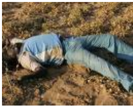
Victim of Darfur

Empathy is harder to muster for enemy soldiers, especially soldiers from strange countries, whose languages we don't speak. One might be appalled by the mass murder of Japanese in Hiroshima or Nagasaki, just as one deplores the deaths of Bangladeshis in a terrible flood, or villagers in Darfur. But as long as they have no recognizable faces, their suffering remains almost abstract, a question of numbers. To make a convincing film about people in an unfamiliar culture is very difficult. European directors in the US often have a hard time catching the spirit of the place. For a foreign director to make a Japanese film without any false notes or cultural slip-ups, a film in which the characters, who speak in subtitled Japanese, are wholly convincing and thoroughly alive, is an extraordinary feat. Several filmmakers, from the pre-war Nazi propagandist Arnold Fanck to the great Josef von Sternberg, have tried. To my mind, Clint Eastwood is the first to have pulled it off.