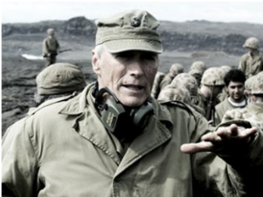
Clint Eastwood on location

A common factor in conventional war movies, whether they are made by Americans, Europeans, or Asians, is the lack of visible enemies. They are there, in the way Indians were there in old westerns, as fodder for the guns on our side, screaming Banzai! or Achtung! or Come on! before falling to the ground in heaps. What is missing, with rare exceptions, is any sense of individual difference, of character, of humanity in the enemy. And even the exceptions tend to fall into familiar types: the bumbling or sinister German, hissing about ways to make you talk, the loud, crass American, the snarling Japanese.