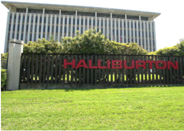
Halliburton Corporation's Houston offices

The report similarly omits bases in Afghanistan, Iraq (106 garrisons as of May 2005), Israel, Kyrgyzstan, Qatar, and Uzbekistan, even though the U.S. military has established colossal base structures in the Persian Gulf and Central Asian areas since 9/11. By way of excuse, a note in the preface says that "facilities provided by other nations at foreign locations" are not included, although this is not strictly true. The report does include twenty sites in Turkey, all owned by the Turkish government and used jointly with the Americans. The Pentagon continues to omit from its accounts most of the $5 billion worth of military and espionage installations in Britain, which have long been conveniently disguised as Royal Air Force bases. If there were an honest count, the actual size of our military empire would probably top 1,000 different bases overseas, but no one -- possibly not even the Pentagon -- knows the exact number for sure.