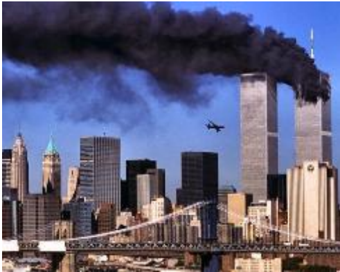
World Trade Center under attack on 9-11

What came to be known as "defense transformation" first began to be publicly banded about during the 2000 presidential election campaign. Then 9/11 and the wars in Afghanistan and Iraq intervened. In August 2002, when the whole neocon program began to be put into action, it centered above all on a quick, easy war to incorporate Iraq into the empire. By this time, civilian leaders in the Pentagon had become dangerously overconfident because of what they perceived as America's military brilliance and invincibility as demonstrated in its 2001 campaign against the Taliban and al-Qaeda -- a strategy that involved reigniting the Afghan civil war through huge payoffs to Afghanistan's Northern Alliance warlords and the massive use of American airpower to support their advance on Kabul.