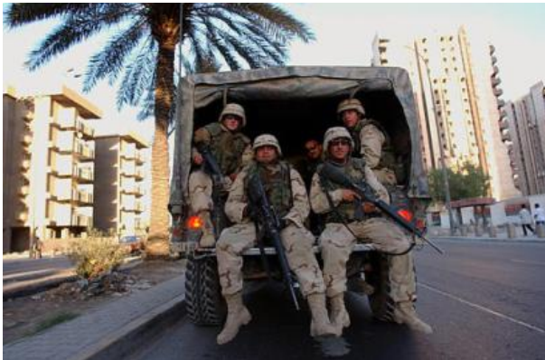
U.S. troop in Iraq

The total of America's military bases in other people's countries in 2005, according to official sources, was 737. Reflecting massive deployments to Iraq and the pursuit of President Bush's strategy of preemptive war, the trend line for numbers of overseas bases continues to go up.