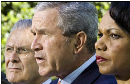
Former US Secretary of Defense Donald Rumsfeld, US President George W. Bush, US Secretary of State Condoleezza Rice

In 2005, deployments at home and abroad were in a state of considerable flux. This was said to be caused both by a long overdue change in the strategy for maintaining our global dominance and by the closing of surplus bases at home. In reality, many of the changes seemed to be determined largely by the Bush administration's urge to punish nations and domestic states that had not supported its efforts in Iraq and to reward those that had. Thus, within the United States, bases were being relocated to the South, to states with cultures, as the Christian Science Monitor put it, "more tied to martial traditions" than the Northeast, the northern Middle West, or the Pacific Coast. According to a North Carolina businessman gloating over his new customers, "The military is going where it is wanted and valued most."