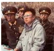
Kim Jong Il and his generals