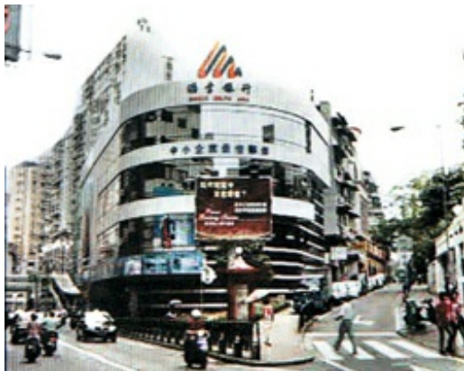
Banco Delta Asia in Macau