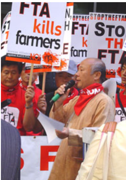
Protest outside negotiations of the U.S.-Korea FTA, Seattle, September 2006.