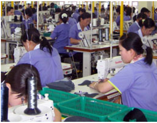
Workers in a factory at the KIC