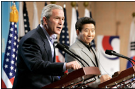
South Korean president Roh Moo-hyun and U.S. president George Bush make a joint statement in November 2005.