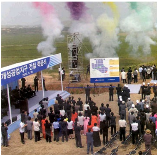
Groundbreaking ceremony for the KIC

The KIC is the centerpiece of North–South economic cooperation under the peace and prosperity policy of South Korean President Roh Moo-Hyun. At present, several dozen South Korean firms operate in the industrial park, with a total of 6,000 North Korean workers. The project is to be carried out in three stages over 10 years between 2003 and 2012. In April 2006, the Ministry of Unification of the Republic of Korea projected that the KIC would grow to over 16,000 acres, employ 700,000 North Korean workers, and have 2,000 companies at the end of 2012 (see Table 2). The U.S. officially supports the KIC. In 2004 and 2005, the U.S. approved several export controls clearances that were required by U.S. law in order for South Korean firms to bring items such as computer and telecommunications equipment to Kaesong (Manyin and Cooper, 2006, p. CRS-18).