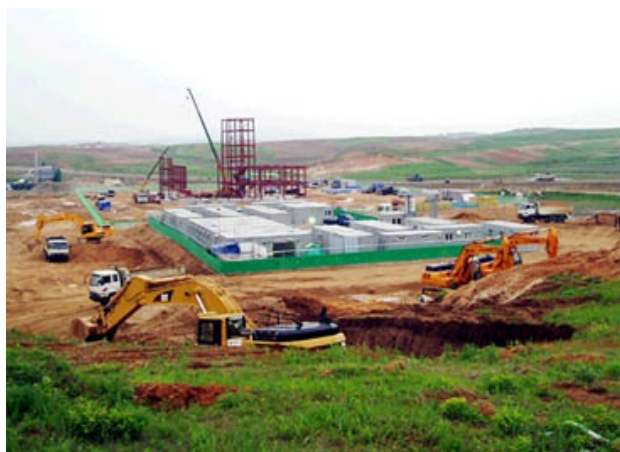
Construction of the Kaesong Industrial Complex

These two new projects have been an advance toward economic cooperation and interaction between the two Koreas. They have not only contributed to economic exchange, but have also demonstrated the possibility of advancing the two Koreas' political relations. South–North economic cooperation is important in promoting reciprocal economic development, the development of the industrial infrastructure, and the building of an integrated industrial structure between the two Koreas. Proponents hold that changes in the economic sector could contribute to the political and military stability of the entire Korean peninsula.