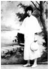
Image 3: 1926 photograph of Xu Guangping (1898-1968)

Inoue's portrait of Lu Xun focuses on the year 1934 in Shanghai when Lu Xun and his common-law wife, Xu Guangping (see image 3), took refuge at the famous Uchiyama Bookstore to avoid persecution as by the Nationalists (Guomindang) led by Chiang Kai-shek.