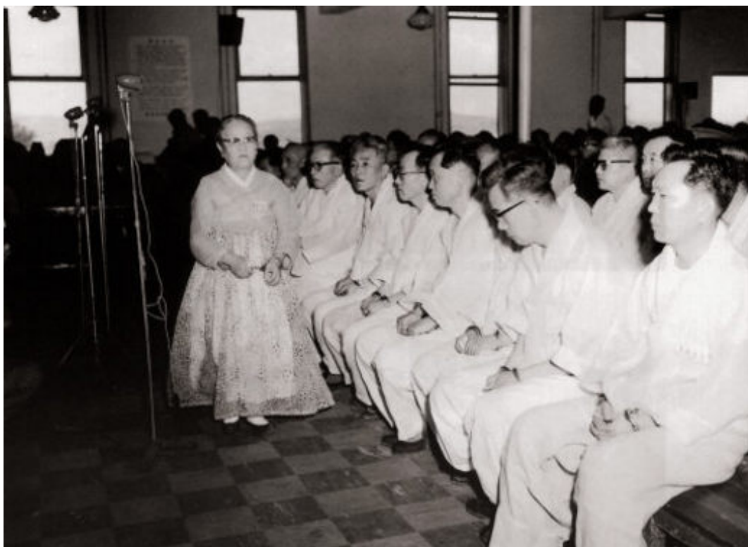
Senior officials of the Minjok Ilbo in court, 1961

As international attention focuses on North Korean breaches of human rights and abductions of Japanese citizens, it is often forgotten that South Korea too, till recently, was responsible for abductions on a grand scale – most notoriously of students and artists from Europe in 1967 to torture and in some cases execute on trumped up charges, and of opposition politician Kim Dae Jung from Tokyo in 1973. Kim, who barely survived a regime bent on his execution, subsequently became president, Nobel laureate, and South Korea's most revered contemporary figure.