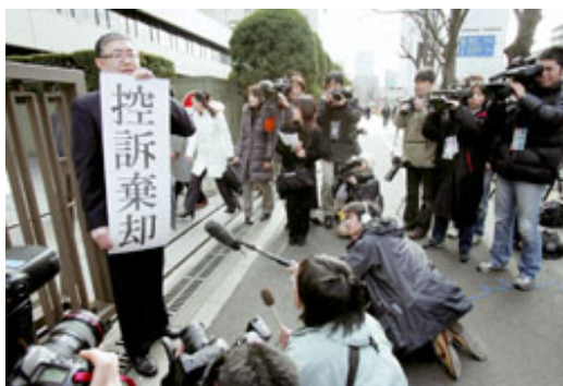
A supporter of defendants shows a banner saying that the appeal has been rejected.

The Tokyo High Court on Friday dismissed appeals brought by the relatives of five men convicted in the so-called Yokohama Incident, the nation's worst case of repression of journalistic freedom during the war.